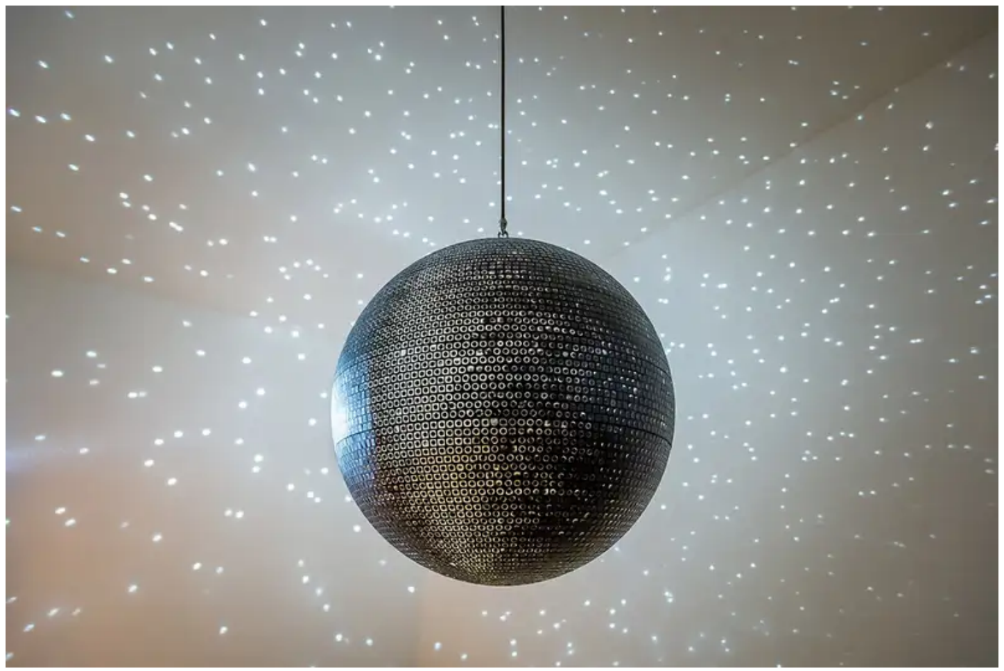
Let's rave until the sun returns Totality (c) Katie Paterson, 2016

In a small white room, deep inside the Lowry in Manchester, UK, a globe – a black sun, perhaps a metre across – hangs with its equator at about head-height. It is covered with tiny reflective squares, each bearing one of thousands of images of solar eclipses seen from Earth. Two beams of light strike the globe from opposite corners of the room, and eclipse images are reflected and projected in slow, dizzying pinwheel loops and arcs across the walls, the floor and people's bodies. It's like a glitterball at a fin de siècle rave where disco and dark industrial finally get together to dance in the moment of totality.