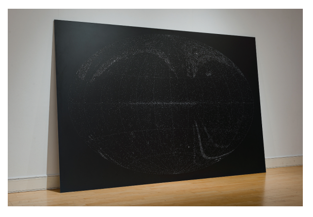
Figure 1. Katie Paterson, All the Dead Stars, 2009 Installation view, Mead Gallery, Warwick Arts Centre, 2013

nature of the cosmos. Stars become in this approach closer to the fragility of human and non-human life on earth.