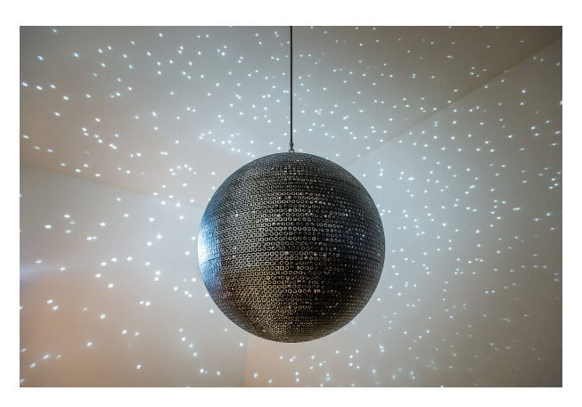
Figure 3. Katie Paterson, Totality, 2016

Science's communicative efficacy is not assured in her work and Paterson presents the fault lines of our relationship to science. Her work becomes a serigraph to wider societal, including its technological developments and, importantly the issues our advancing progress raises. The role of observation is crucial for Paterson in teasing apart these ideas. She mirrors scientific procedures through adopting their strategies of observation and processes of looking, but in the presentation and display of her work she undermines the very methods used to produce them through failing to contextualize her findings. That is, her work does not reinforce science's authority. As Mary Jane Jacob (2016) notes, Paterson's work shares with science a commitment to observation. This can be seen in her 2016 piece "Totality" (see Figure 3). Decorating the outside of a mirror ball, which when exhibited is hung from the gallery ceiling, the artist has covered the surface of the ball with 10,000 images of all known solar eclipses. Ranging from early