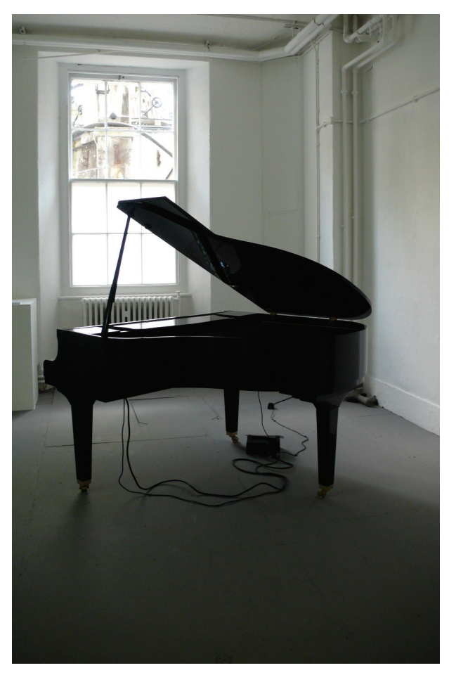
Figure 4. Katie Paterson, Earth-Moon-Earth (Moonlight Sonata Reflected from the Surface of the Moon), 2007 Installation view, the Slade School of Fine Art, 2007

of contemporary technology does not rupture this lineage but in fact supports it. In this, we can see a confluence of Ottinger's second and third category of approaches to cosmology. We can see this played piece, out in her 2007 "Earth-Moon-Earth (Moonlight Sonata Reflected from the Surface of the Moon)" (see Figure 4). For this piece, Paterson took Beethoven's Moonlight Sonata and converted into Morse code before sending it as a radio signal to the moon, from where it bounced back to Earth. In the process of transmission, the surface of the moon interfered with the score and only sent back a partial recording. In the subsequent exhibition, a selfplaying, pre-programmed Disklavier Grand piano plays the new score, translating the indentations and crafters of the moon as breaks and gaps in the music. In his analysis of this piece, art historian Nicolas Alfrey reflects on Paterson's choice of music. As the epitome of romantic music, the Moonlight Sonata is an icon to this particular sensibility that has arguably lost its ability to invoke "authentic feeling" (2009, 8), and in making this choice, Paterson is not only engaging with the music but the wider narrative in which it is embodied. For Alfrey, sending Beethoven's piece