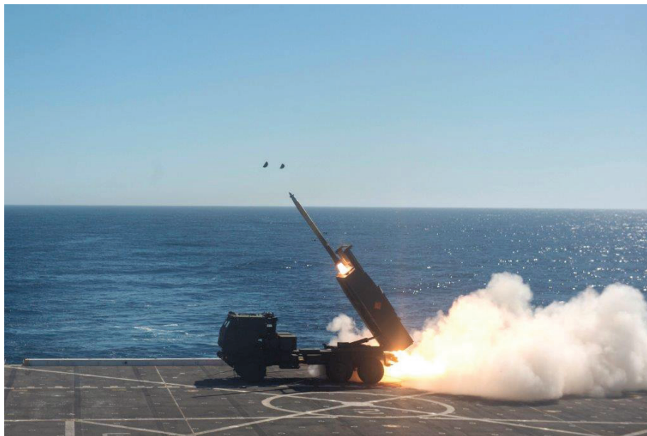
HIMARS firing from the flight deck of the USS Anchorage (LPD-23).

Recent maturation of HIMARS employment tactics, techniques, and