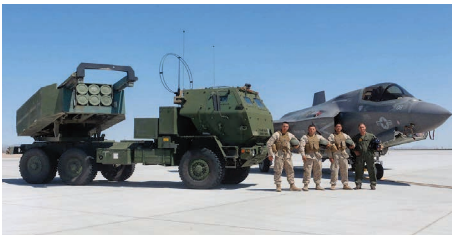
HIMARS/F-35.

The Marine Corps Operating Concept and Marine Corps Force 2025 each challenge the Service to innovate to meet the needs of a dynamic 21st century battlefield. Status quo, however, will not suffice, and the importance of developing innovative solutions to these significant Service-level challenges remains paramount. As the demand for long-range precision munitions increases on today's complex battlefields, innovative employment options for the M142 HIMARS provide a viable option to both GCE and MAGTF commanders, both today and in the years ahead.