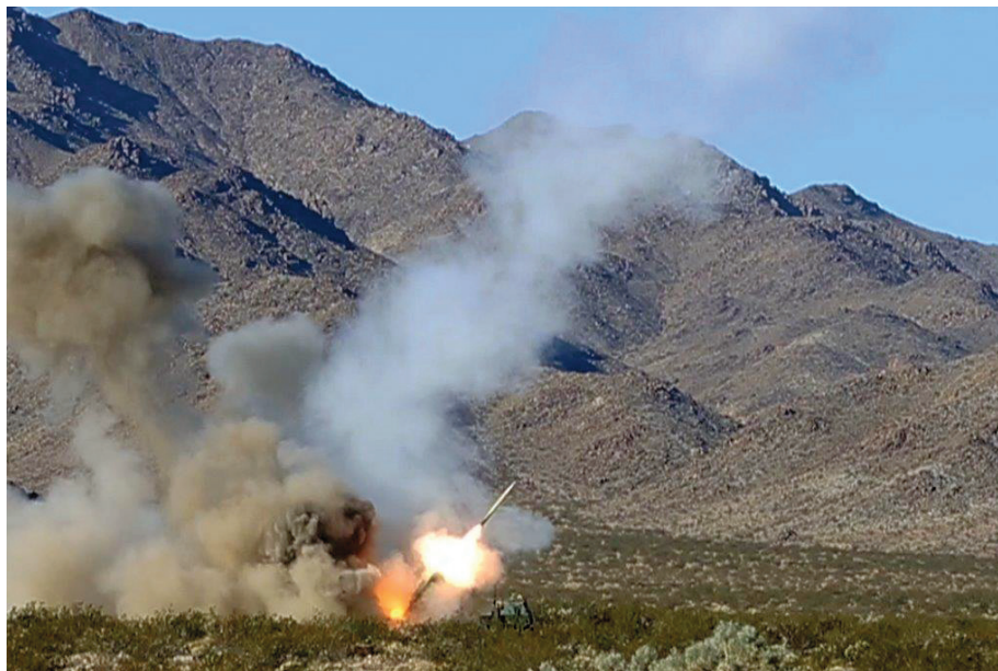
HIMARS firing during LSE-17, Twentynine Palms.

The multi-role F-35 represents a revolutionary leap in air dominance capability with enhanced lethality and survivability in hostile, anti-access airspace environments. The aircraft combines fifth-generation fighter aircraft characteristics—advanced stealth and integrated avionics—with a comprehen-