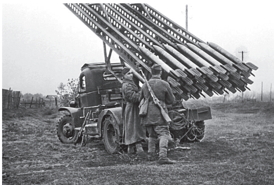
A Katyusha rocket launcher. (Ref for "BM 13 ref" chicomiranda.wordpress.com .)

Modern MLRSs can trace their origins back to the 1930s and 40s, during which the United States, Germany, and Russia developed basic, truck-mounted launchers designed for mobility and large volumes of fire. In 1983, at the height of the Cold War, the M270 MLRS made its debut with the U.S. Army. Built on an extended Bradley Fighting Vehicle chassis, the M270 series launcher was fielded in order to provide massed volumes of rapidly fired ballistic rockets on large troop