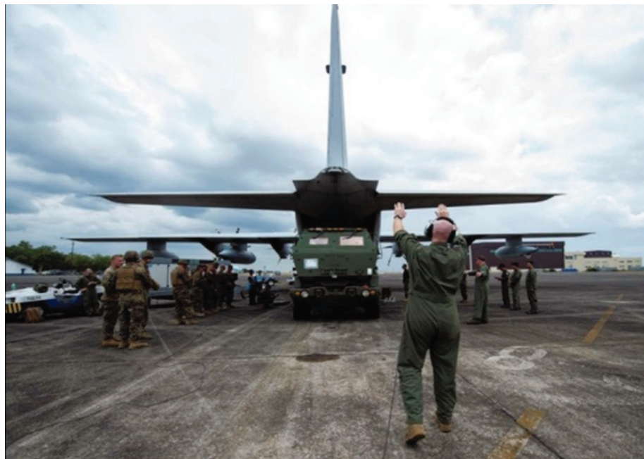
HIMARS/C-130 embarkation.

Over the past sixteen years, the Marine Corps has routinely operated at ranges in excess of 600 to 800 miles and beyond from the littorals. Concurrently, the decrease in available amphibious shipping has created gaps which have been partially mitigated by the creation of special purpose MAGTFs as well as split/disaggregated MEU formations. In doing so, logistical challenges and gaps in fire support capabilities have likewise emerged.