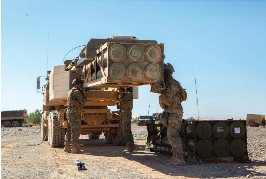
HIMARS platoons from 11th and 14th Marines have shown themselves capable of conducting raid and airlift operations.

gistical requirements of HIMARS fires in support of high-end conventional operations. HIMARS, when desired, can additionally provide a very visible signature and demonstration of commitment to allies and NATO partners.