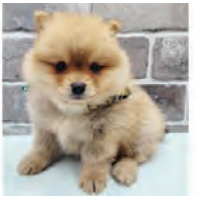
POMERANIAN PUPPIES Adorable males and females, toy or teacup sizes, shots and papers. Call 718-306-4136