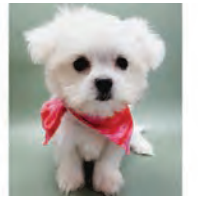
MALTESE PUPPIES Adorable males and females, toy or teacup sizes, shots and papers. Call 718-306-4136