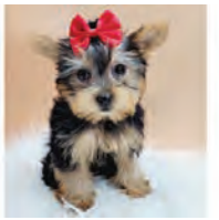
YORKIE PUPPIES ADORABLE, pure bred, toy & teacup sizes. Call 718-306-4136