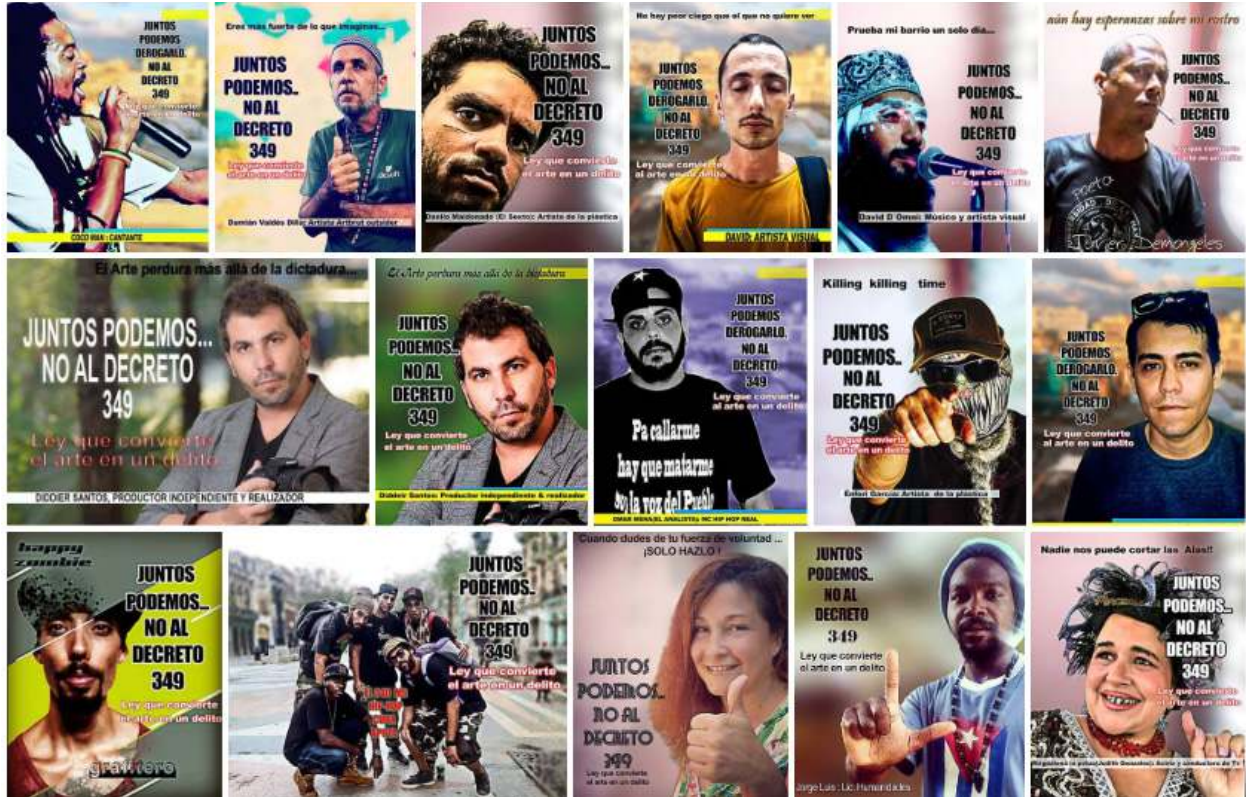
Posters for #NoAlDecreto349 campaign, 2018.

As it stands currently, the decree goes against Cuba's commitment to respect fundamental human rights and puts artistic freedom in jeopardy. Unless the regulations promised by the Ministry of Culture address all concerns, we recommend that Decree 349 be repealed.