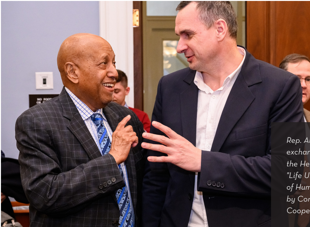
Rep. Alcee Hastings (D-FL) exchanges with Oleg Sentsov at the Helsinki Commission's hearing, "Life Under Occupation: The State of Human Rights in Crimea"

The voices of writers, academics, and public intellectuals who challenge authority, introduce new ideas, interrogate assumptions, and unearth truths are a bulwark against efforts to foreclose discourse, suppress expression, and define a single social and political narrative. The power writers and intellectuals wield makes them targets of persecution in many forms. PEN America has documented growing threats to writers globally, including in countries where such dangers were once rare, such as India and Turkey, and in increasingly restrictive authoritarian states such as Egypt, Russia, Saudi Arabia, and China. Those who attempt to research and document contentious periods of history, to pen commentary about ethno-linguistic issues in or defend the use of a minority language, or who advocate on behalf of women's rights in countries where these rights are circumscribed are all too often targeted for reprisals. Detention and imprisonment is the most widespread tactic, with writers vilified as enemies of the state, slapped with