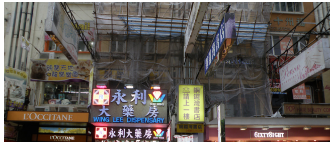
The exterior of Causeway Bay Books in Hong Kong, owned by publisher Gui Minhai, stands humbly in between stores selling vitamins and clothing.

the writer Fang Fang has faced online abuse and been attacked in state media for her online diary of life in Wuhan during the lockdown, 7 and author, academic, and activist Xu Zhiyong has been held incommunicado since mid-February after publishing an essay calling for President Xi to resign and criticizing, among other things, Xi's efforts to hide the truth of the outbreak. 8 The Chinese government even went after Nobel Prize winning author Mario Vargas Llosa, describing as "irresponsible" a column in the Spanish newspaper El País in which Vargas Llosa stated that the virus had originated in China and criticized government attempts to silence those who raised the alarm about the outbreak. 9 In an interview with The New York Times about her decision to document the lockdown, Fang Fang said, "If authors have any responsibilities in the face of disaster, the greatest of them is to bear witness." 10