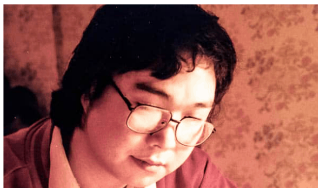
Writer and publisher Gui Minhai was sentenced to ten years' imprisonment in China.

critical voices, as has been the case with publisher, writer, and bookseller Gui Minhai. In late 2015, Gui, a Swedish citizen based in Hong Kong, disappeared from his vacation home in Thailand and appeared months later in Chinese custody. 80 On February 25, 2020, after years in detention or house arrest, forced public confessions, and a lengthy, opaque trial throughout which he had difficulty accessing Swedish consular services, Gui was sentenced to ten years imprisonment and five years' deprivation of political rights for "illegally providing intelligence overseas," 81 a charge likely levied in retribution for his cooperation with Swedish officials attempting to secure his release.