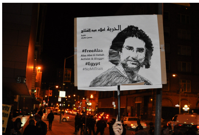
Protesters in San Francisco, California demonstrate international support for blogger Alaa Abd El Fattah's following his initial arrest in 2011 related to his participation in the Tahrir Square protests.

ber 2019, Cuban rapper Maykel Castillo Pérez, who is monitored closely by authorities, was approached by police without cause, and the interaction ended with Castillo Pérez being briefly held and beaten after he disavowed the Cuban President, Miguel Díaz-Canel. 102