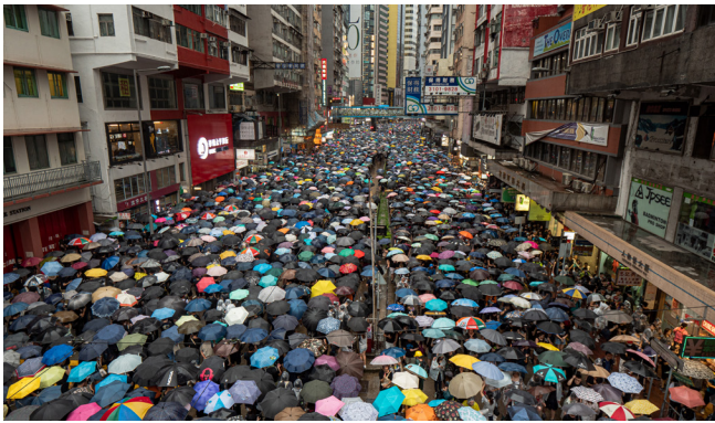
In August 2019, protesters occupy the streets of Hong Kong in opposition to new legislation introduced earlier in the year, in April, allowing the extradition of criminal suspects to mainland China.

family or his lawyers. 83 A number of his Tohti's students and colleagues have also been detained. 84