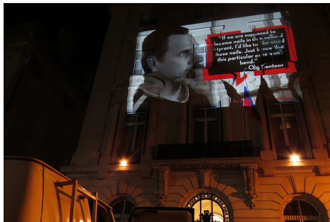
An image of Oleg Sentsov is projected onto the Russian consulate in New York on February 26, 2018, a Worldwide Day of Action to call for his release. His quote reads: “If we are supposed to become nails in the coffin of a tyrant, I’d like to be one of those nails. Just know that this particular nail won’t bend.”

sentenced to a nine-year prison term; while in prison, he underwent a hunger strike in late 2018 on behalf of another unjustly detained writer. 135