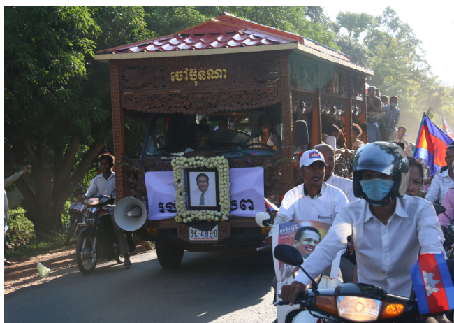
A funeral procession to Takeo Province honors Dr. Kem Ley two weeks following his assassination on July 10, 2016.