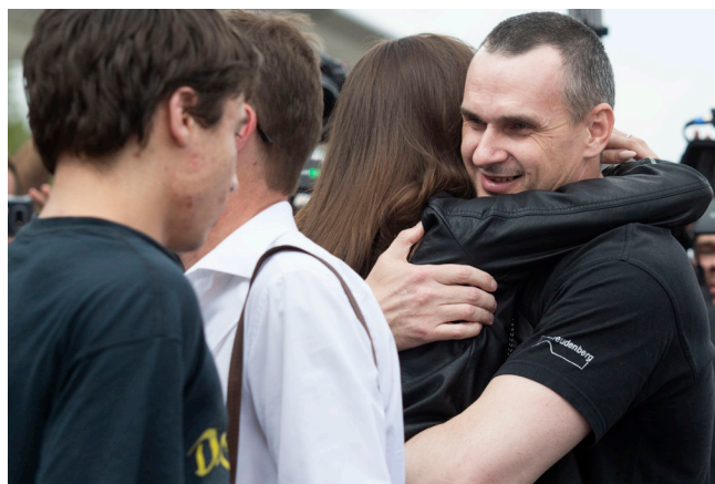
Oleg Sentsov reunites with his daughter in Kyiv, Ukraine in September 2019 following a historic prisoner swap between Russia and Ukraine.