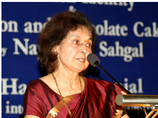
Nayantara Sahgal presents the launch of her work of fiction Mistaken Identity in November 2007.

Threats against writers' physical safety or lives occur less frequently but are, of course, devastating, and often particularly so because those responsible for such crimes are so rarely held to account. Masterminds and perpetrators seldom face justice, and the severity of these crimes has a widespread