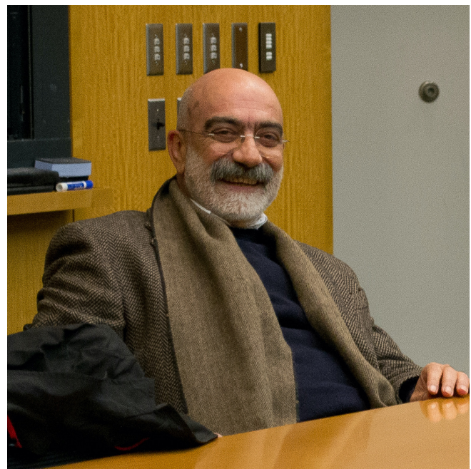
Harvard University’s Kokkalis Program at the Kennedy School hosts Ahmet Altan in January 2012 for a seminar entitled “Turkey and the Obscure Object of Violence.”

As Altan’s words make clear, storytelling is a form of freedom; so is speaking the truth. Through their words, writers can transcend the bars of prisons, but they should not have to. The 238 writers, academics, and public intellectuals included in PEN America’s 2019 Freedom to Write Index were detained or imprisoned because, through their writing and their work, they shed light on the truth. And in doing so, they threatened the narrative of the powerful. In this moment, when truth is vulnerable, and when the world faces a time of reckoning in which a new future waits to be written, it is imperative that we defend the freedom to write, and work to free those who remain behind bars for daring to exercise that power.