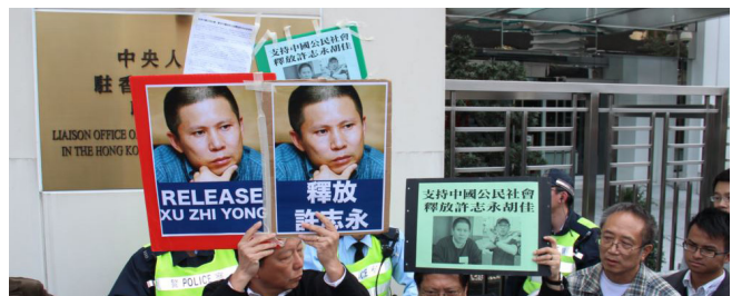
Protesters in Hong Kong hold signs in support of academic and activist Xu Zhiyong's release from prison following his 2013 arrest.