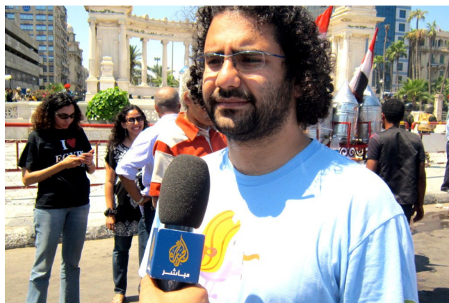
Alaa Abd El-Fattah, a key voice in the Arab Spring, gives an interview to media outlet Al Jazeera in June 2011.

Of course, writers and intellectuals are frequently targeted in non-legal or carceral ways as well. These types of threats—which have affected at least 100 writers and public intellectuals included in the Writers at Risk Database—may include physical attacks, online harassment campaigns, intimidation, surveillance and monitoring, and efforts to force individuals out of employment or cut off outlets for their writing and work. Police in Cuba frequently monitor the movement of activists, writers, and artists, and subject them to unwarranted police interrogations and beatings, as well as surveillance, to deter “counterrevolutionary” expression. In Decem-