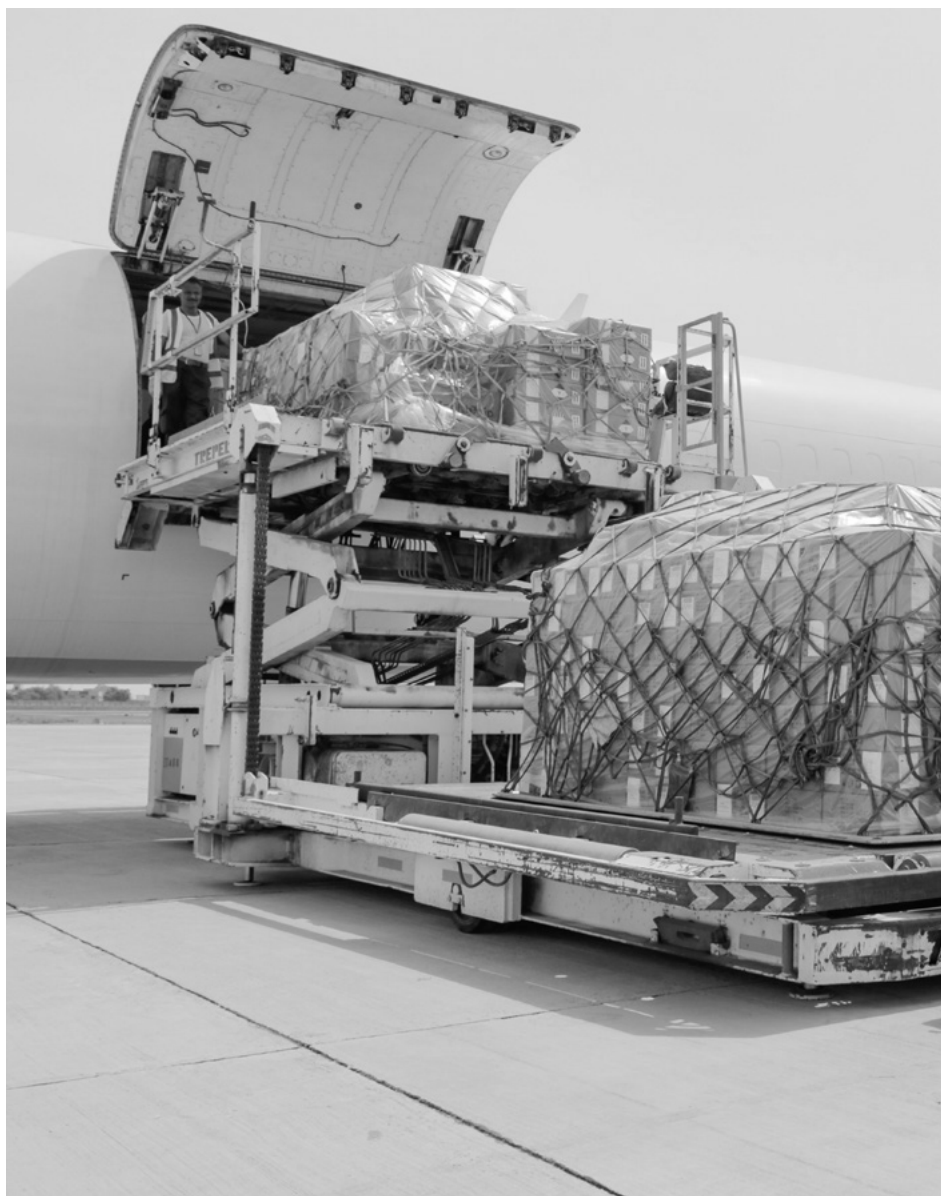
Medical supplies and personal protective equipment arrive at Aden Airport. 2020, Yemen.