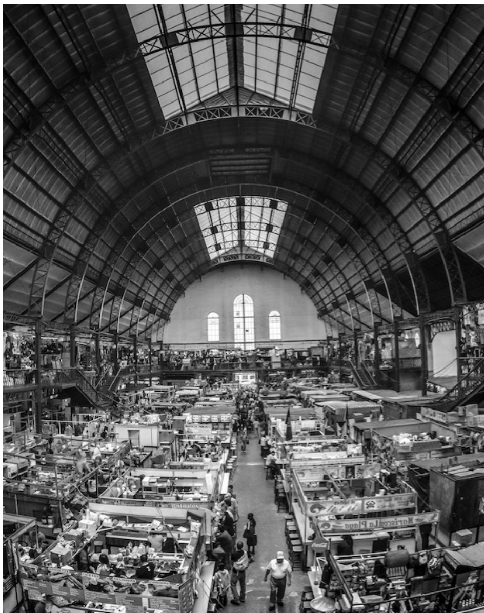
An overview of the National Center for Epidemiological Emergencies and Disasters warehouse in Mexico. 2020, Mexico.