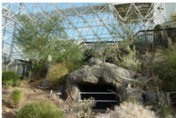
Figure 5. Desert biome showing some of the spatial heterogeneity.

Spatial heterogeneity of biomes. Because all the biomes except the agricultural biome originally were designed to simulate natural ecosystems, they include substantial spatial heterogeneity.