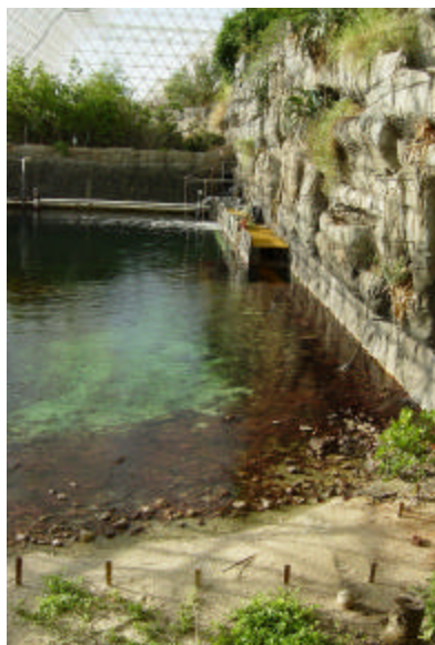
Figure 3. Ocean biome with coral reef.

Recent work at B2C has examined all of these issues. For example, studies of reactive trace gases emitted from trees have provided data on chemical species that are too labile to be studied effectively in the field. This work was facilitated by another feature of B2C, the exclusion of ultraviolet radiation (UV), which allows reactive compounds to survive much longer than they would in the field. There was some discussion during the review about the possibility of closing the nitrogen budget in a real sense. Specifically, it may be possible to measure N 2 loss via denitrification in such a facility using 15 N tracers. This has been done in the past using very small microcosms and also with chambers on the soil in a field setting. Each of these techniques has problems: the microcosm is too small to be realistic and the field flux chambers invariably introduce artifacts (e.g., changes in moisture, temperature, windspeed) into the measurement of gas flux from the soil. While as yet untested, the B2C facility offers an intermediate scale of measurement, which may be the most realistic approach for closing the N budget. Measurement of such fluxes on the scale of the biomes at B2C would likely introduce few artifacts.