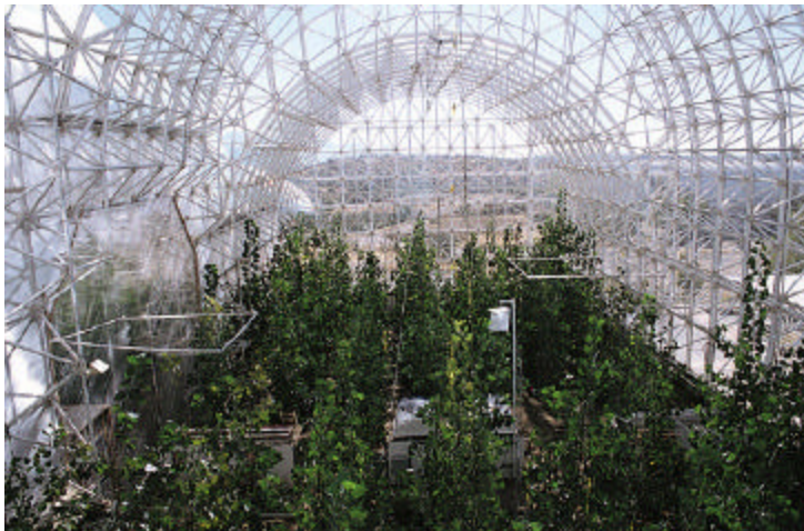
Figure 2. Cottonwood trees growing in one of the three chambers of the agricultural biome.

large assemblages of plants, including trees, it is possible to explore scale-related relationships from the leaf to the canopy. These two features are crucial in allowing investigators to develop bottom-up or mechanistic models and test them against top-down measurements. Studies of the combined effects of changes in temperature and CO 2 on agroecosystems are possible in B2C, although with only three chambers, the number of treatments that can be imposed simultaneously is limited.