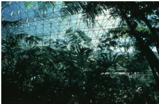
Figure 4. Rainforest biome.

Sample size of one. A fundamental limitation of B2C is that the “natural” biomes exist as single units, meaning that treatments or replicates have to be performed sequentially in time rather than simultaneously.