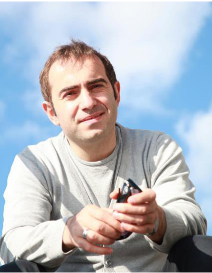
Turkish journalist Emre Oğuz