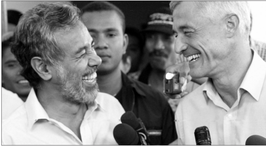
Newly elected East Timor president Xanana Gusmao, left, smiles after being congratulated by Sergio Vieira De Mello, head of the UN Transitional Administration in East Timor, Wednesday, 17 April 2002, during a meeting in Dili.

insufficient to threaten domestic policy-makers or make them pressure foreign perpetrators, for instance by cutting military supplies, which could have restrained Jakarta but embarrassed a powerful ally, the United States. Public opinion on foreign policy rarely determines national elections. Likewise, remnant survivors of genocides wield minimal electoral clout. In the Aboriginal case, on such a domestic issue their conservative opponents rebuffed the example of the same powerful ally: U.S. recognition of injustices to Native Americans. Even when media monopolies don't consign the facts to obscurity, governments can often ignore both foreign models and domestic protests by victimized minorities — as well as protests against policies on faraway tragedies.