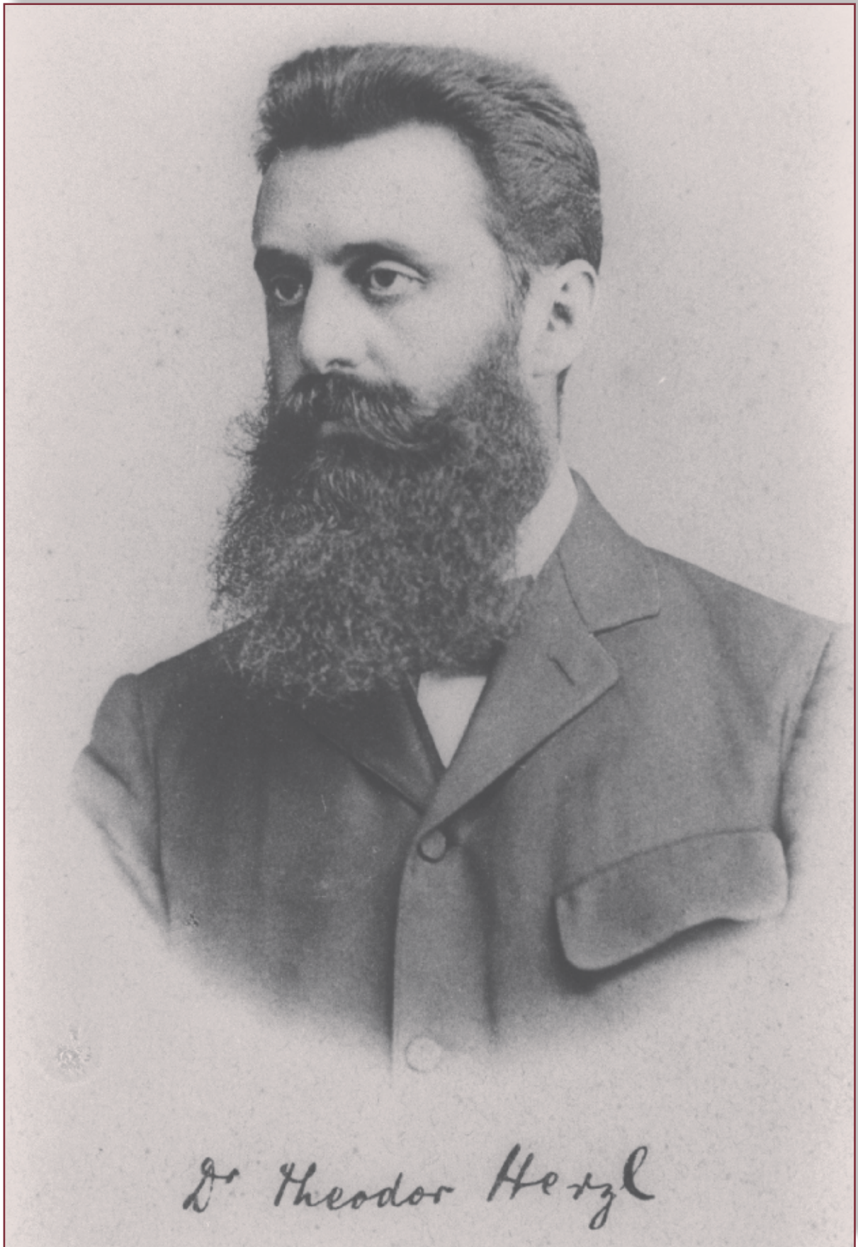
Theodor Herzl, 1900