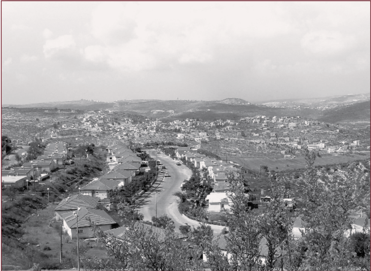
Ariel, an Israeli settlement in the central West Bank

was not designed to cover situations like Israeli settlements in the occupied territories, but rather the forcible transfer, deportation or resettlement of large numbers of people. 19