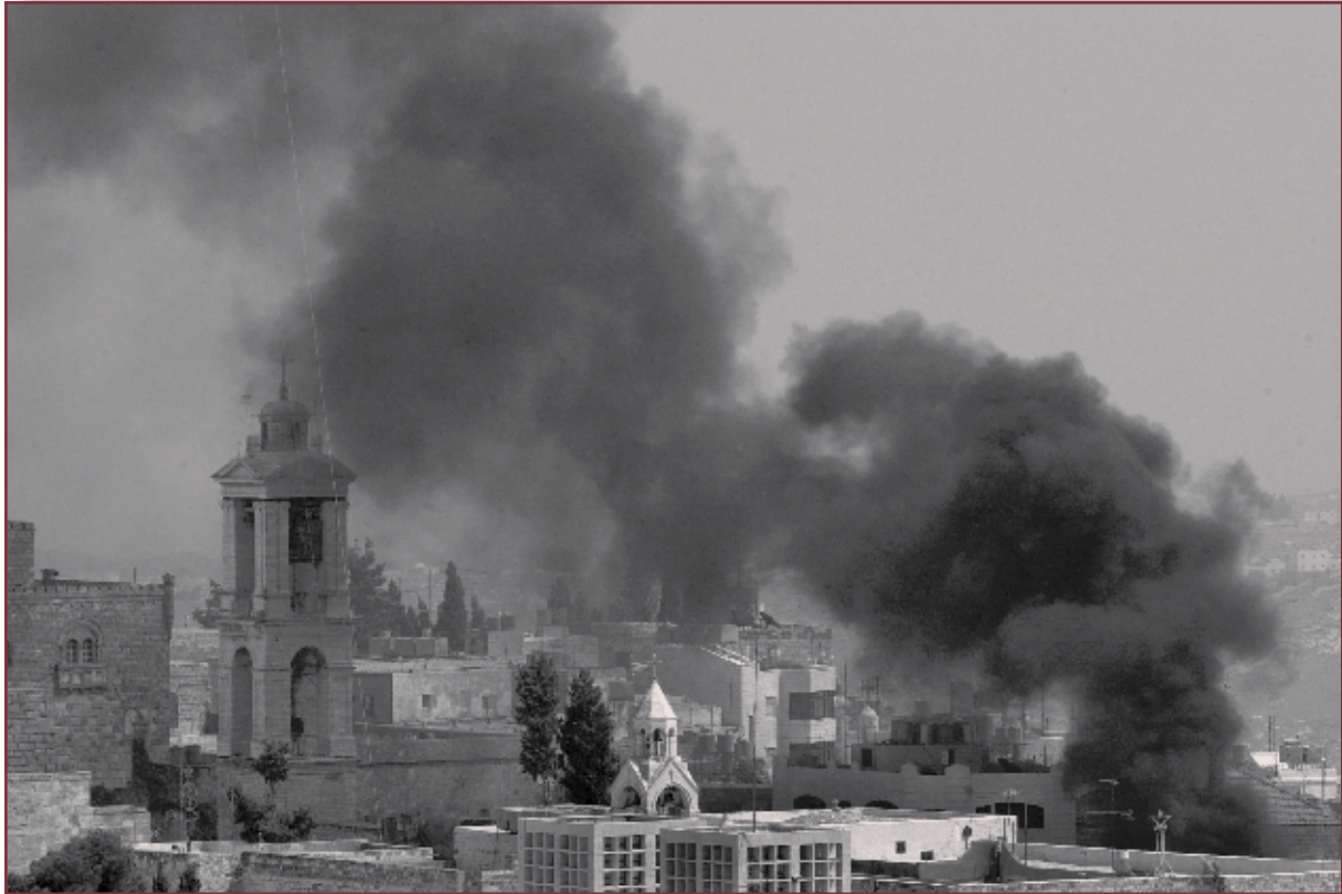
Black smoke billows over the Church of the Nativity compound in the West Bank town of Bethlehem on April 11, 2002, after the church was seized by a joint unit of Fatah and Hamas. The clergy were taken hostage and the interior was desecrated.

Tomb with a group of Breslover Chasidim. These events have reinforced Israeli concerns about who will protect the holy sites.