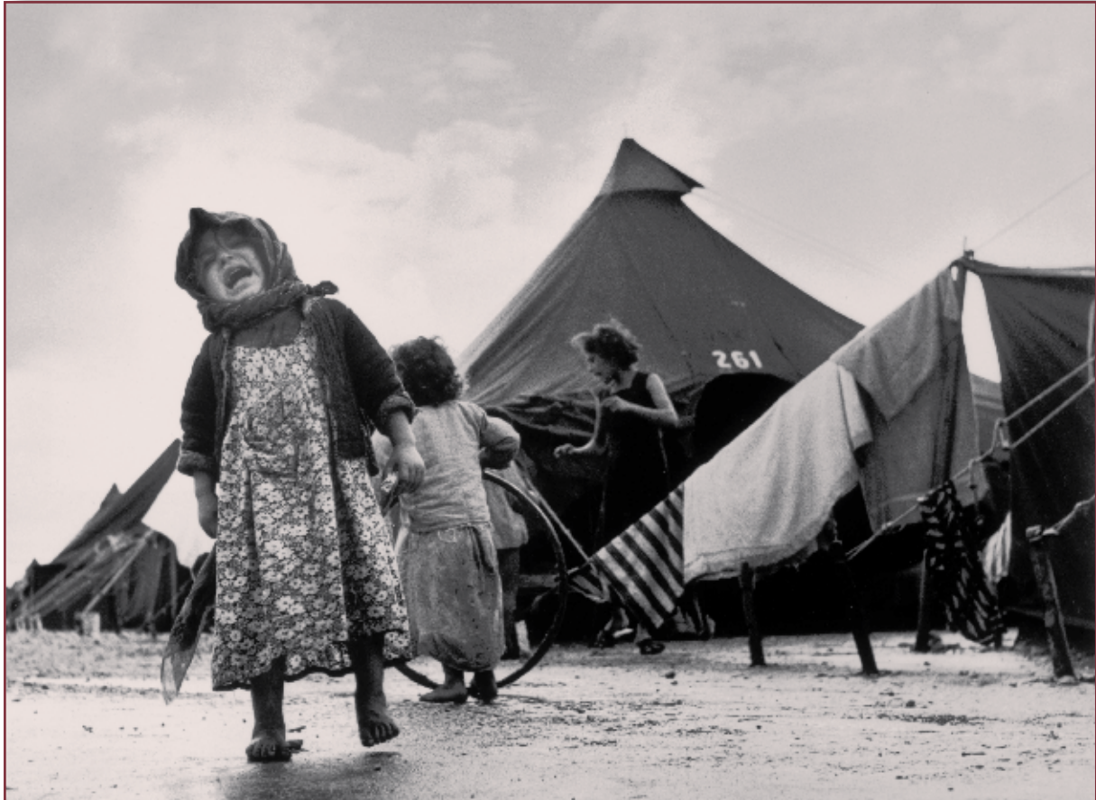
Hundreds of thousands of Jewish refugees from Arab states arrive in Israel. Initially they live in refugee camps, but are shortly integrated into Israeli society.