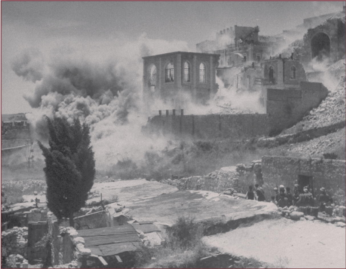
During 1948 synagogues and religious academies come under attack in the Old City of Jerusalem and are shelled by the artillery of the Arab Legion. Here, the Porat Yosef Yeshiva is destroyed.