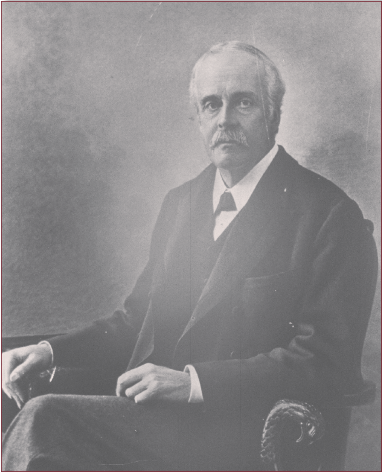
British Foreign Secretary Arthur James Balfour, 1917

The British Government supported the Weizmann-Feisal Agreement with regard to both Jewish immigration and land purchase. On June 19 the senior British military officer in Palestine, General Clayton, telegraphed to the Foreign Office for approval of a Palestine ordinance to re-open land purchase 'under official control'. Zionist interests, Clayton stated, 'will be fully safeguarded.'