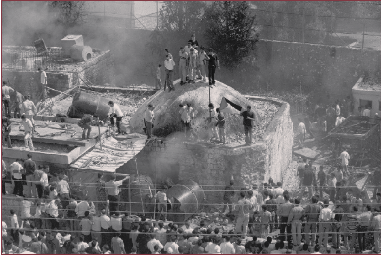
Palestinians stand atop the biblical Tomb of Joseph in the West Bank town of Nablus, October 7, 2000. Palestinian gunmen and civilians stormed the Israeli enclave, trashing Hebrew texts and setting fire to the holy site in a show of triumph just hours after Israeli troops evacuated the site.