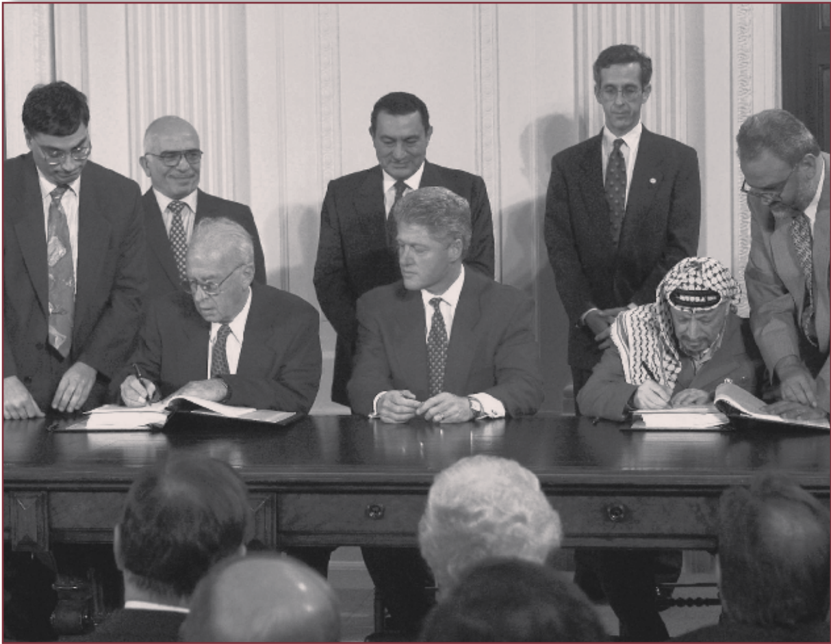
President Bill Clinton, Israeli Prime Minister Yitzhak Rabin, and PLO leader Yasser Arafat sign the Oslo II Interim Agreement, September 28, 1995, at the White House.