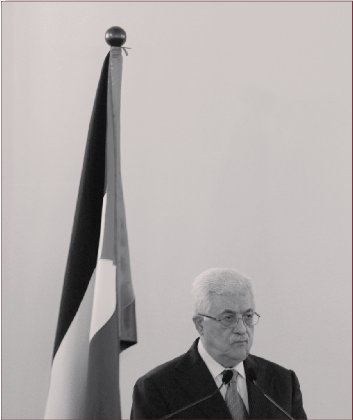
Palestinian President Mahmoud Abbas in Barcelona, Spain, July 20, 2011