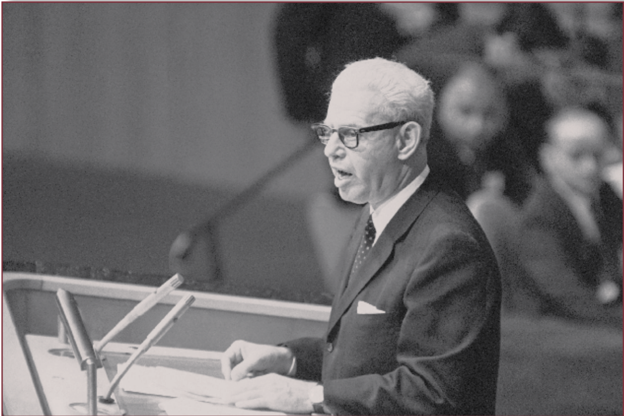
U.S. Ambassador to the United Nations Arthur Goldberg addresses the emergency session of the UN General Assembly in New York on June 19, 1967.