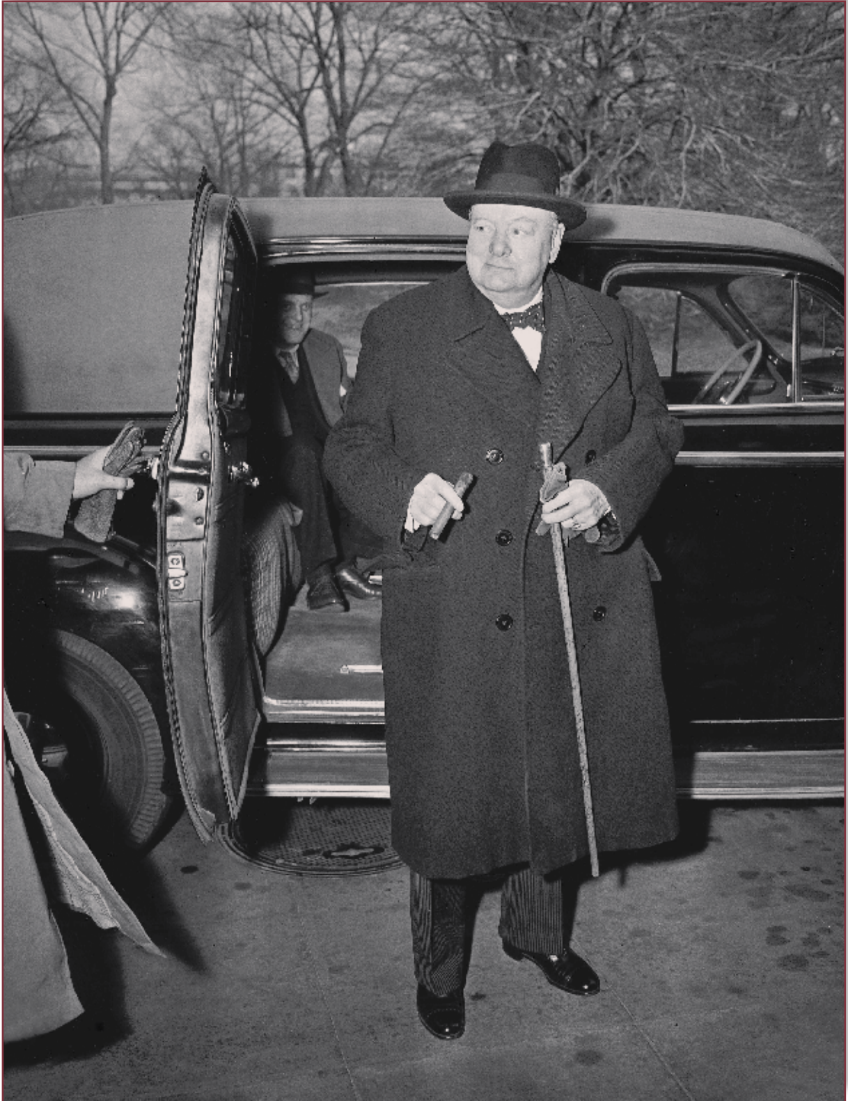
Winston Churchill, Britain's wartime prime minister, arrives at the White House in Washington on March 11, 1946.