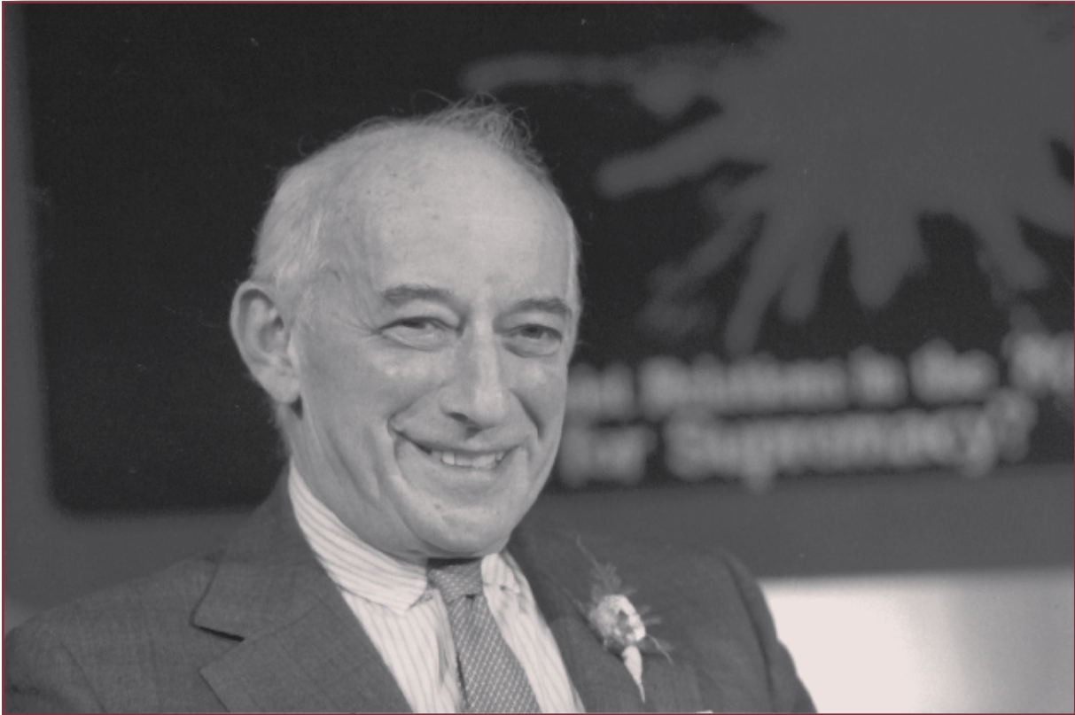
Eugene Rostow, former Dean of Yale Law School and Undersecretary of State for Political Affairs in the Johnson administration