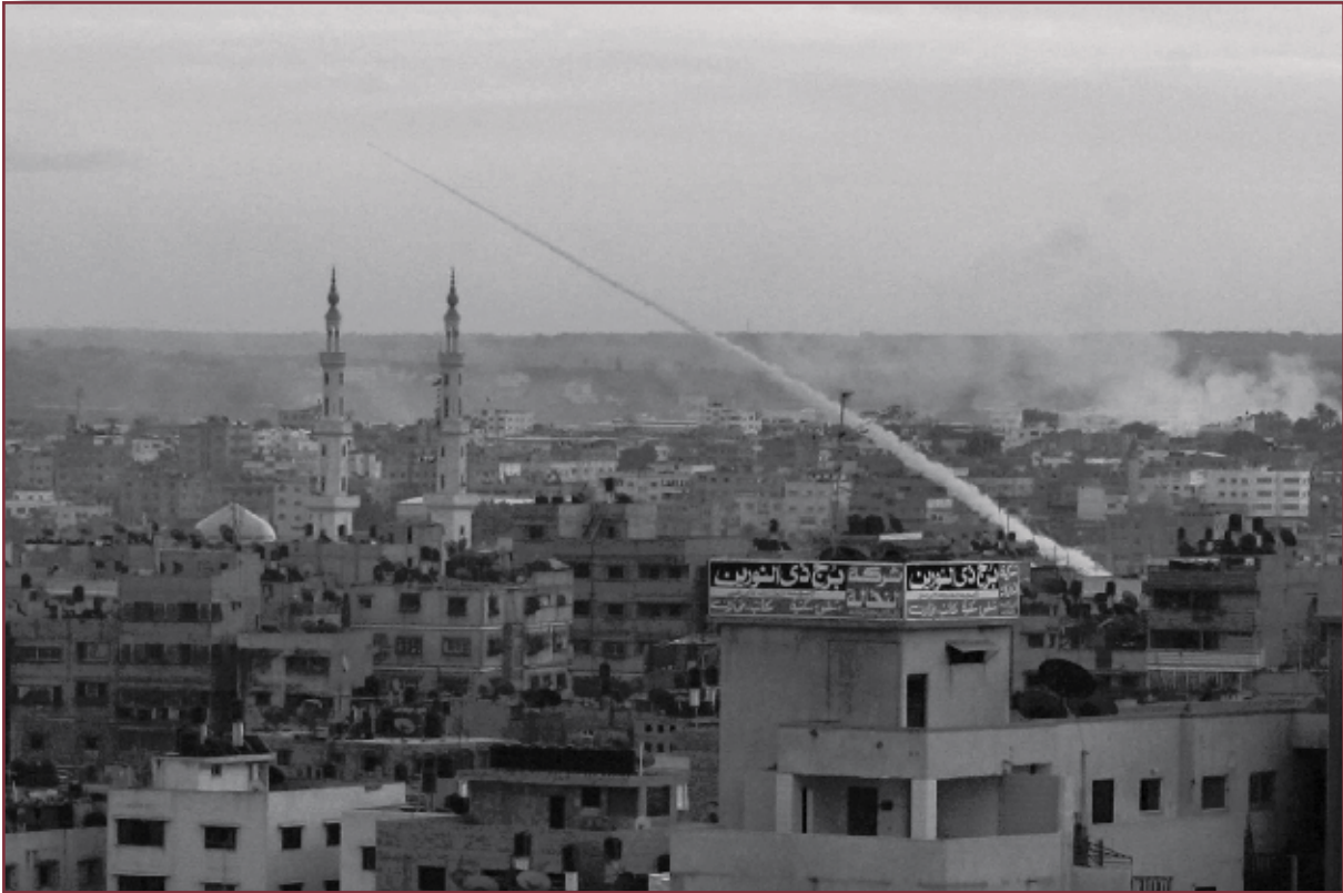
Rocket attacks in Israel from the Gaza Strip lead to Operation Cast Lead.

of dozens of Fatah officials. Following this coup Hamas gained control over all the government apparatus in the Strip. 15