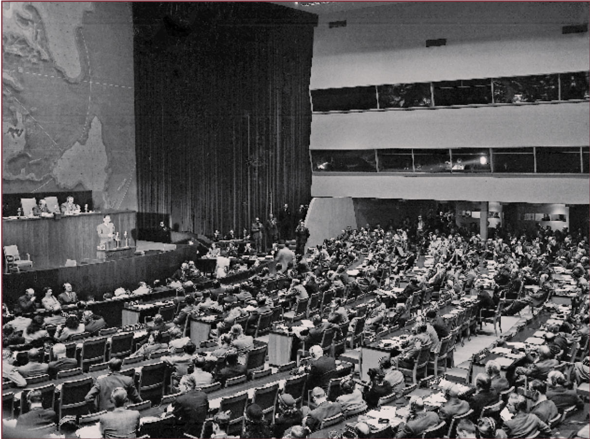
On November 29, 1947, the UN General Assembly adopted Resolution 181, also known as the Partition Plan, which called for the establishment of a Jewish state alongside an Arab state in Palestine. The resolution was accepted by the Jewish Agency. However it was rejected by the Arab Higher Committee and the Arab League.

It should be clear that this demand also means that Israel is not permitted to act so as to secure a Jewish majority in it. Similarly, it is not allowed to promote conditions that will facilitate the continuing self-determination of Jews in it. I believe these conclusions are not warranted. Israel may promote Jewish state-level self-determination in it. In this sense, it is permitted to maintain a stance that is not neutral toward the national and cultural affiliations of its population. At the same time, the arguments supporting Jewish self-determination also support the recognition of similar rights to Palestinians in a part of their homeland. While Jews are not strangers to this country, Palestinians are longtime natives in it. They live here by right, and have not immigrated to the country. They are entitled to exercise self-determination in their homeland even if they are required to share it with Jews – the second people for which it is a homeland.