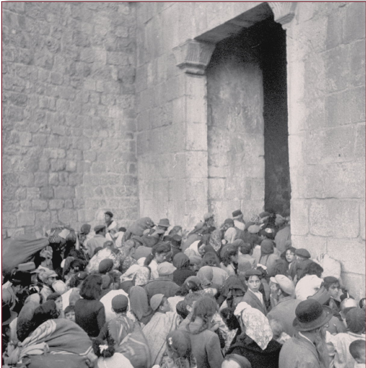
Jewish refugees stream out of the Old City of Jerusalem in 1948 escaping the invading Arab Legion. (Phillip John, Getty Images, 1948)

What struck legal experts writing in this period was the fact that the Jewish people never renounced those rights and indeed acted upon them through prayer, fasting, and pilgrimage. In the diplomacy of modern Israel, that refusal continued in one form or another, especially after the Six-Day War. Significantly, these rights were backed by some of the most important authorities on international law.