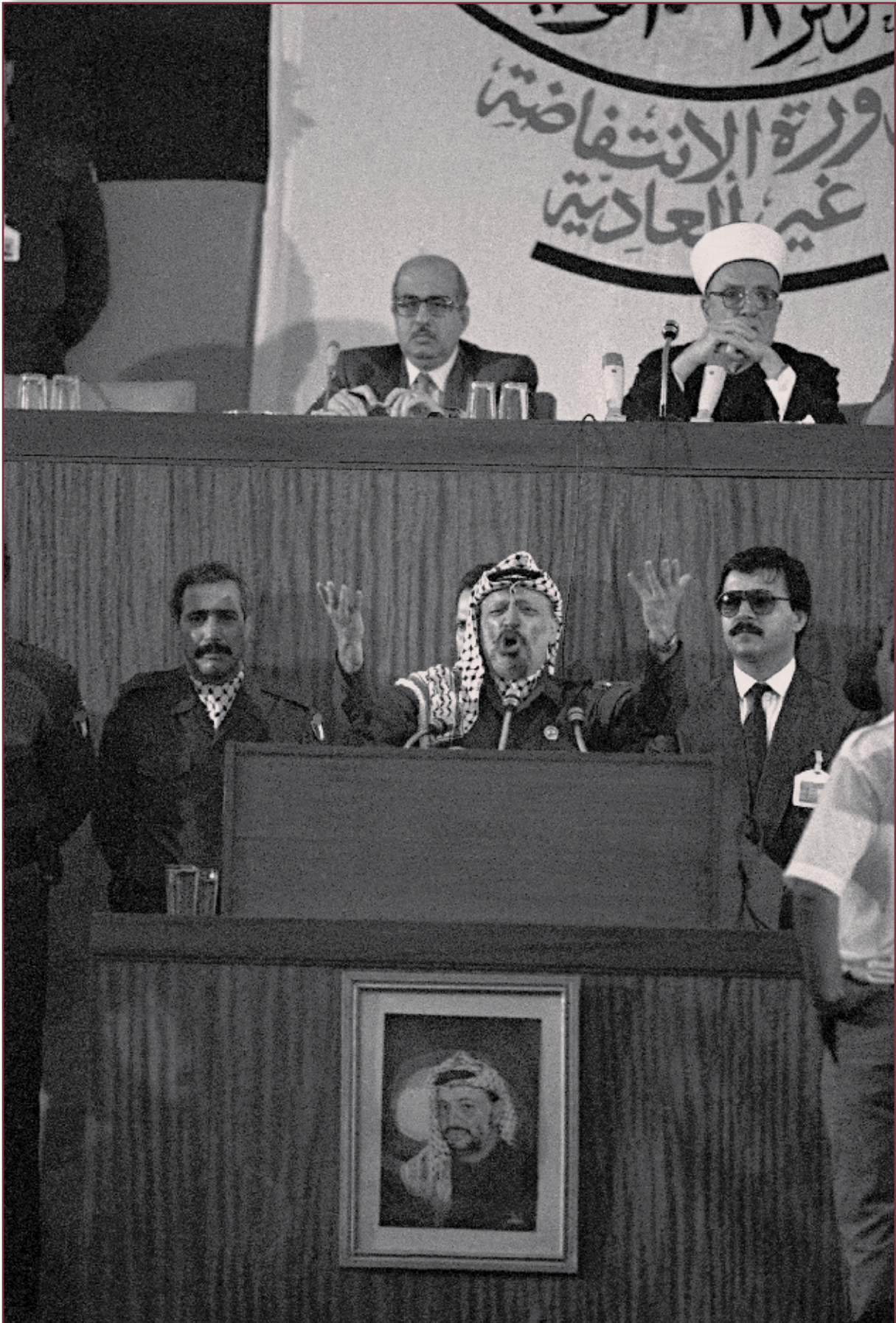
PLO Chairman Yasser Arafat addresses the Palestine National Council in Algiers, November 12, 1988.