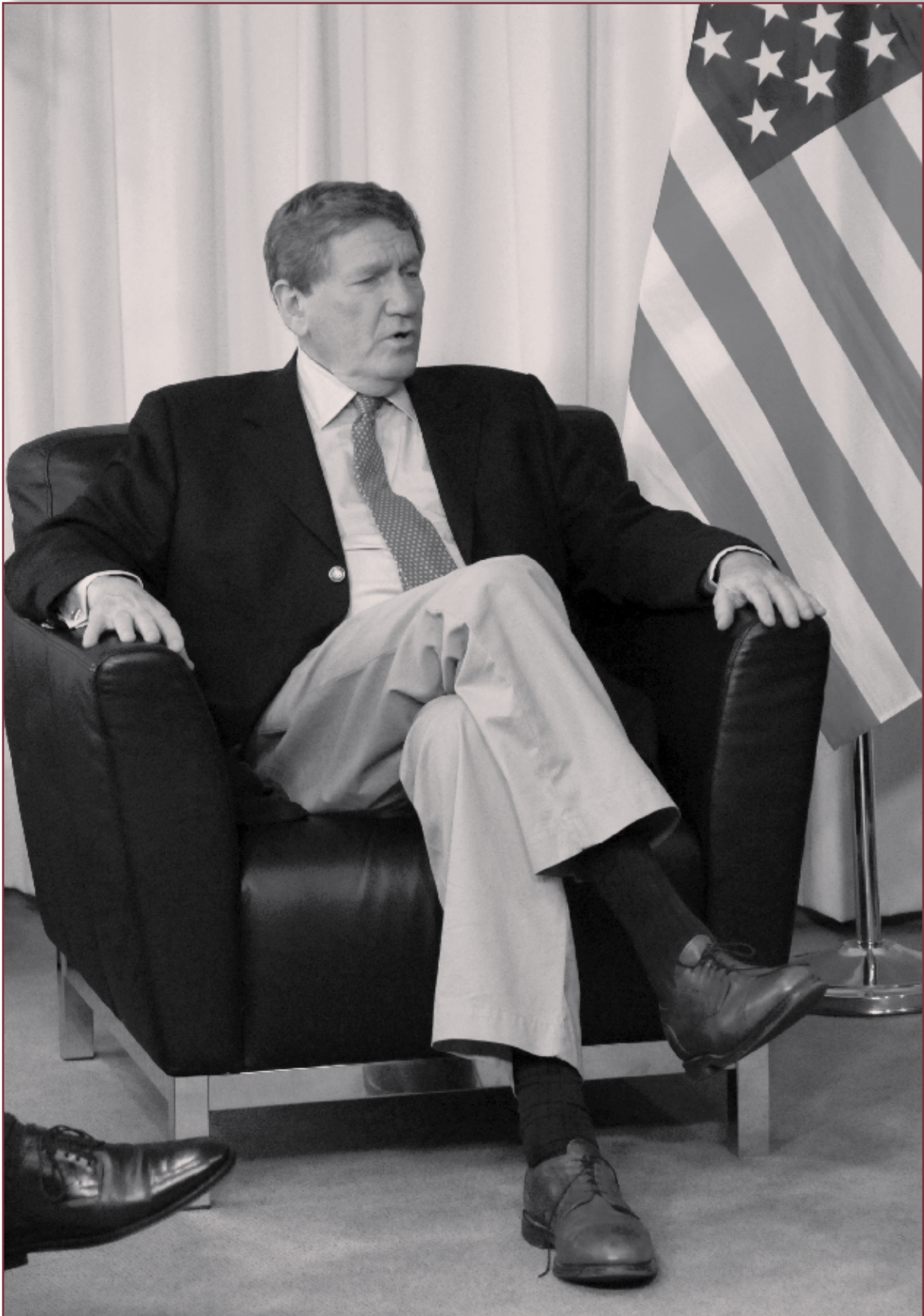
Ambassador Richard Holbrooke, U.S. Permanent Representative to the UN in 1999, sought to obtain for Israel the right of sovereign equality in the UN system, including the right to be elected to the UN Security Council.