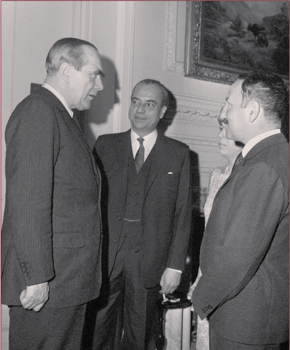
Lord Caradon (left), Britain's ambassador to the UN in 1967, who drafted Resolution 242 with Ambassador Arthur Goldberg of the U.S.