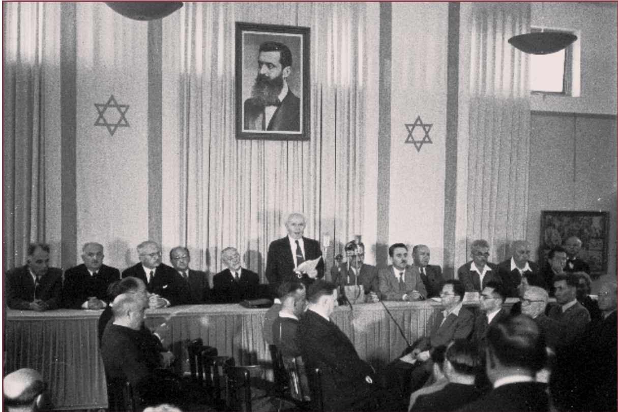
David Ben-Gurion flanked by the members of his provisional government reading the Declaration of Independence at the Tel Aviv Museum, May 14, 1948