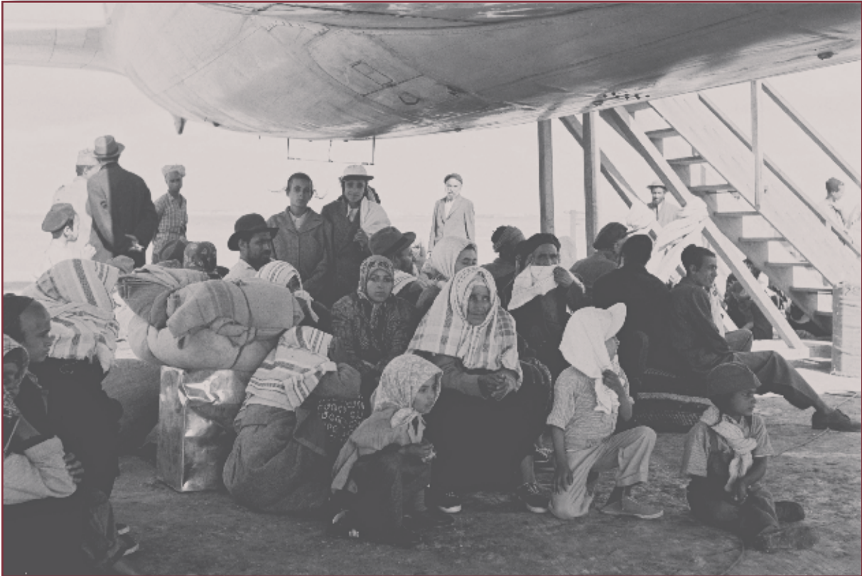
Jewish refugees, bound for Israel, wait for an airplane with their belongings as they escape persecution in Yemen, 1949.

This historical record is important as today, its detractors claim that Israel is an illegitimate state made up of Jews who are foreign to the region – insinuating that this is the root cause of the Arab-Israeli conflict. For example, Iranian President Mahmoud Ahmadinejad has stated that Jews in Israel “have no roots in Palestine,” and “If the Europeans are honest they should give some of their provinces in Europe – like in Germany, Austria or other countries – to the Zionists and the Zionists can establish their state in Europe.” 3 In another speech, Ahmadinejad cited the events in Europe as the reason Jews left there, stating that “then the Jews must return to where they came from... If there really had been a Holocaust, Israel ought to be located in Europe, not in Palestine.” 4