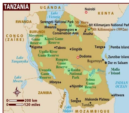
The Map of the United Republic of Tanzania showing the geographical territory

The United Republic of Tanzania is the result of a theory being put into action, since the Union of Tanganyika and Zanzibar was made possible by a determined and honest people. The Union serves as living proof of the fact that the people of Tanganyika and Zanzibar under their leaders meant what they spoke and were not just making political rhetoric.