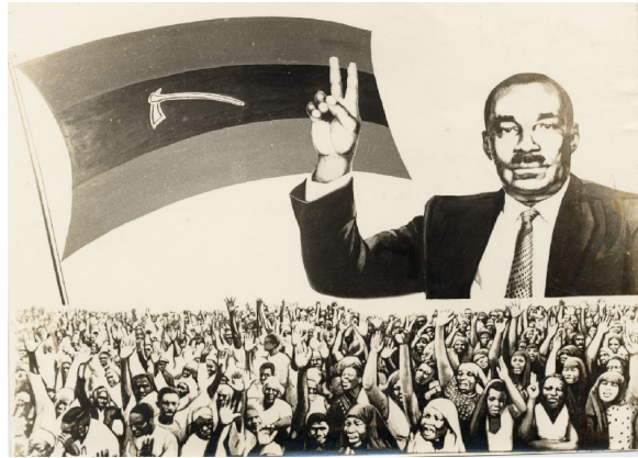
The President of Zanzibar Sheikh Abeid Aman Karume in picture immediately after the revolution in 1964.