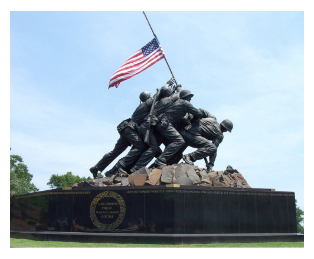
Figure 2.—The Marine Corps War Memorial, which depicts the famous battle of Iwo Jima. The memorial is dedicated to all Marines who have given their lives for the United States since 1775.

The county got its name from the Arlington Estate, which was the residence of General Robert E. Lee and his family until the war when it was confiscated and then bought at auction by the Federal Government. The son of General Lee later received compensation from the U.S. Government for the family's loss of the estate. The grounds of the estate were used for various purposes by the government but most notably as the Arlington National Cemetery. The cemetery attracts visitors from all over