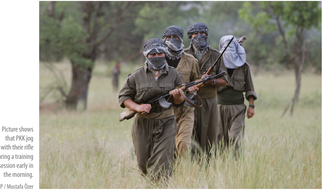
that PKK jog with their rifle during a training session early in the morning.

Third, the fighting was professionalized as both sides had central commands and typically avoided attacks that may harm civilians. KIVE does not indicate any patterns of categorical terrorism that involve indiscriminate killing of civilians. <sup>4</sup> As Table 1 shows, most deadly attacks typically do not target civilians. <sup>5</sup> Additionally, there is no evidence of spoilers or fragmentation that complicates the dynamics of the conflict despite widespread suspicions about shadowy groups acting autonomously.6 Furthermore, the violence did not have a strong ethnic or sectarian dimension that beset communal relations in neighboring countries such as Iraq and Syria. Despite occasional flares-up, violence did not spread out among different ethnic groups living together.<sup>7</sup> No year saw more than 100 citizens killed as a result of the armed conflict. The fatalities on both the Turkish state and the insurgency side were comparable. With the exception of 2012 when more than 300 PKK militants lost their lives, neither side had more than 200 fatalities in a year. Power asymmetries did not directly translate into significant differences in fatality rates.