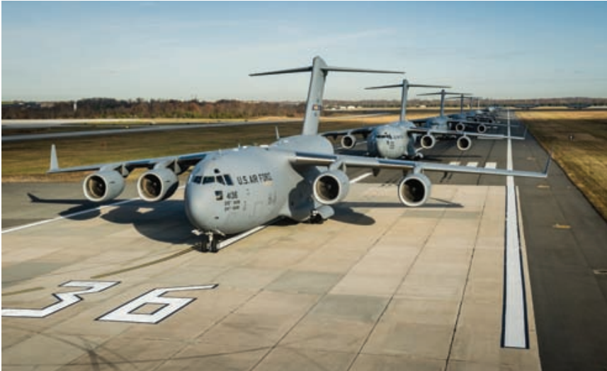
US Air Force

The US Air Force has received its last C-17s, with all production to cease during 2015