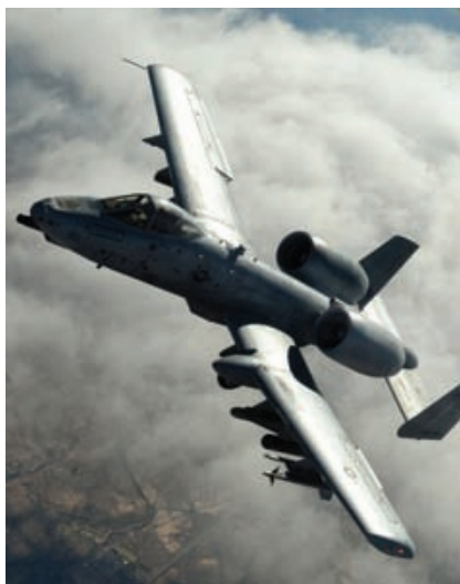
US Air Force

The world’s largest military aerospace project, the Lockheed-led F-35, has enjoyed