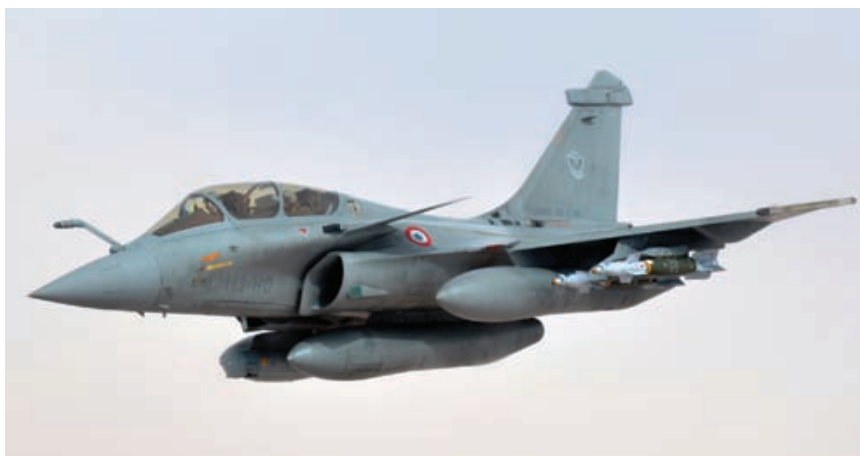
Operation Serval in Mali saw France conduct long-range strikes using its Rafales