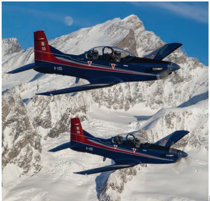
India introduced 20 PC-7 Mk IIs within the year, and fielded the C-17 and P-8I too