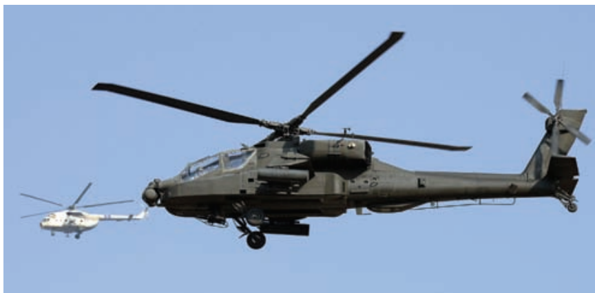
Backed by hardware like the AH-64D Apache, Egypt's military took control of the nation