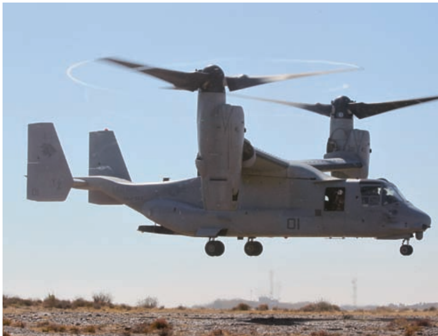
Washington has pledged to “expedite” the delivery of six V-22 tiltrotors to Israel