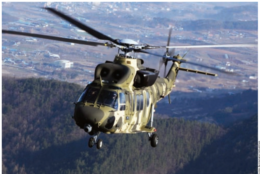
South Korea's indigenous Surion utility helicopter has entered service with its army