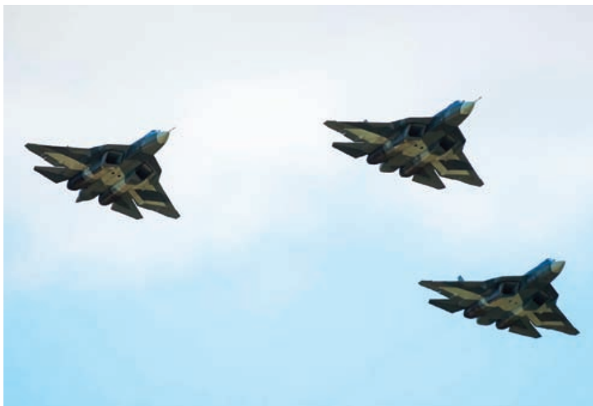
Russia's first air force pilots have had the chance to fly the fifth-generation T-50 fighter