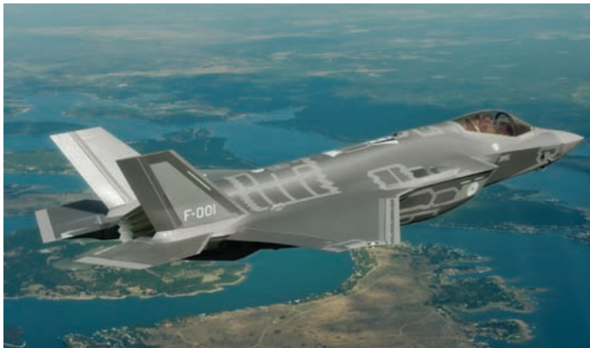
The Netherlands expects to acquire a reduced fleet of just 37 F-35 Joint Strike Fighters