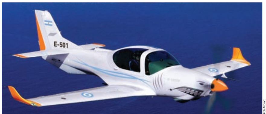
Argentina's air force introduced its first G120TP trainers in 2013, as did Indonesia