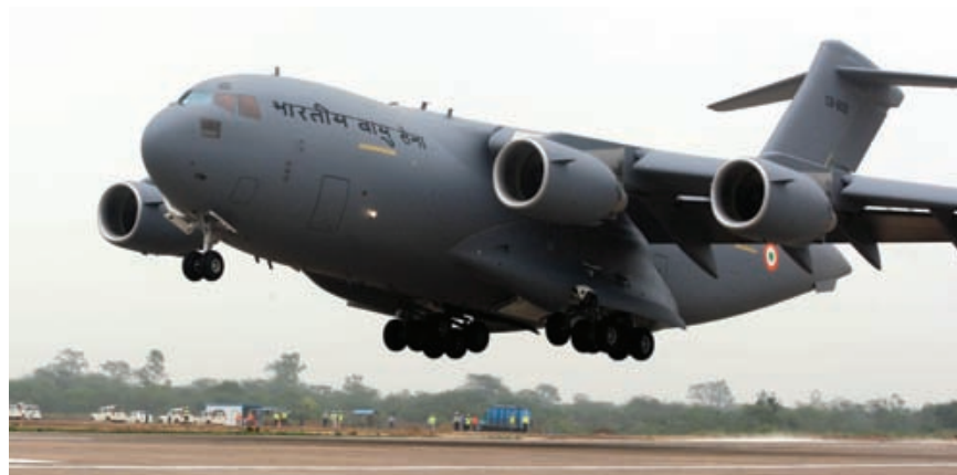
India's military modernisation drive has seen it introduce C-17 strategic transports

Afghan air force's tactical transport capabilities, however, with a recently-introduced fleet of Alenia North America-prepared C-27As having been parked, and some of their duties assumed by a pair of ex-US Air Force Lockheed Martin C-130Hs.