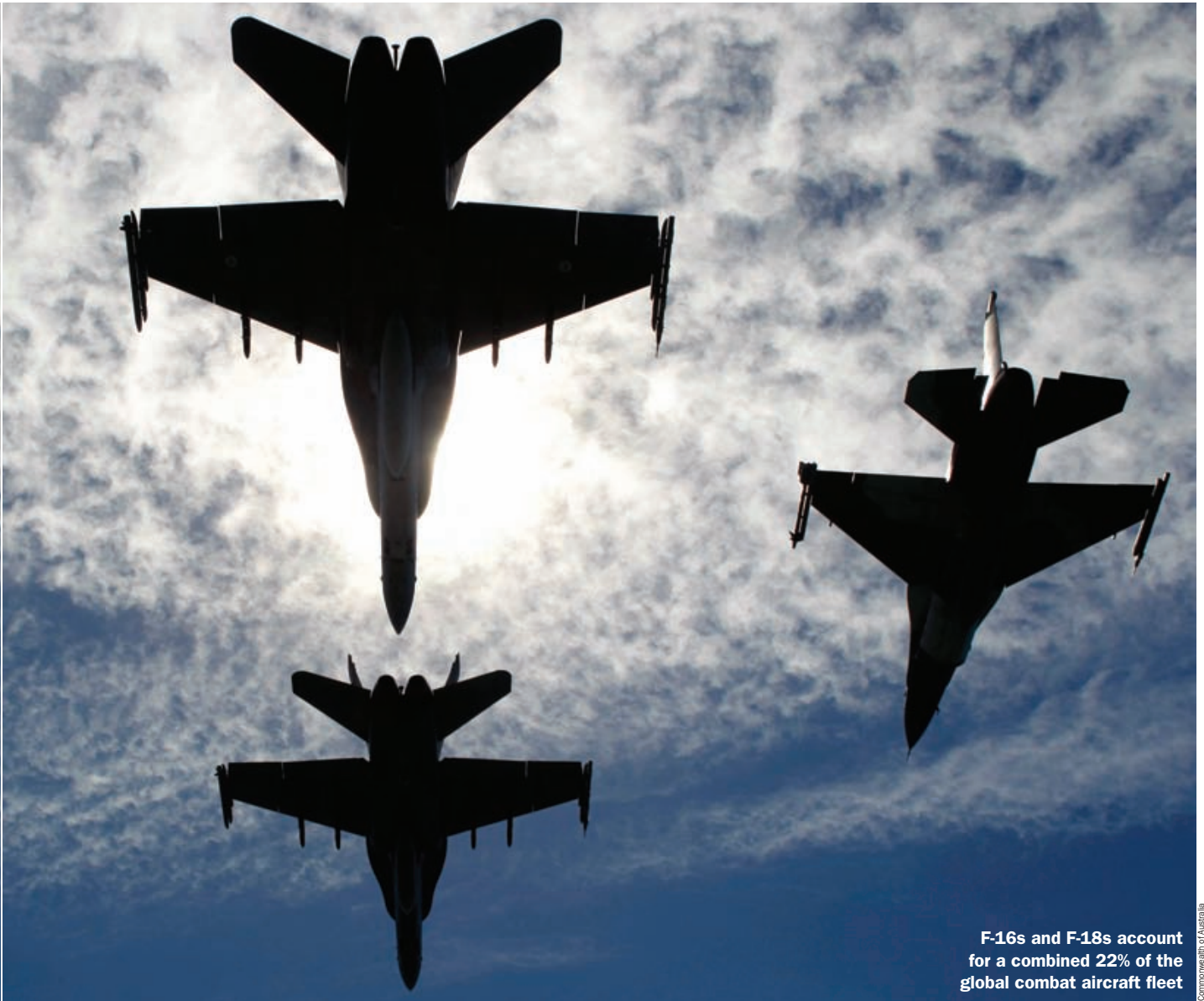
F-16s and F-18s account for a combined 22% of the global combat aircraft fleet