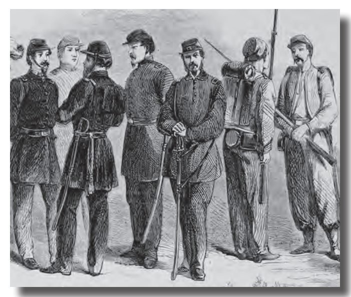
Uniforms of United States Volunteers and State Militia, Harper's Weekly 5, no. 244 (31 August 1861): 552–553.

On 15 April 1861, the day after the surrender of Fort Sumter, President Lincoln called seventy-five thousand militiamen into service to crush the rebellion. In mid-July, as it became clear that the conflict would not be soon resolved, Congress authorized a volunteer army of five hundred thousand. Within the first months of 1862, its ranks had swelled to more than seven hundred thousand. By the end of the war, more than two million had served in Union uniform. These uniforms were of material interest to those same garment manufacturers who had sat listless and despondent in the months before the first artillery shells were lobbed at the fateful fort in Charleston Harbor. The rapid mobilization overwhelmed the regular army, an institution familiar with outfitting the sixteen thousand within its ranks but unprepared for the avalanche of enlistees. At least in theory each soldier should have been equipped with an annual allowance of one cap and one hat, two jackets, three flannel shirts, three pairs each of trousers and drawers, and four pairs of stockings and the same of shoes. Whatever the eager enlistees wore in the spring and summer of 1861 needed to be produced in great haste and great quantity.