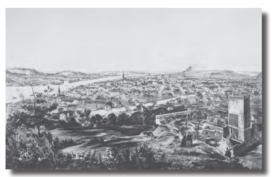
Mid-nineteenth-century Cincinnati