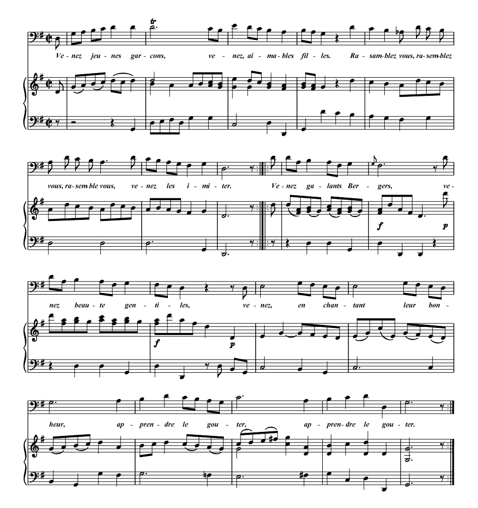
Example 9. Rousseau, Le devin du village, Scene 7 Air, mm. 1-19.

It would seem that enough evidence has been brought forward to show that, from a musical point of view, it is an error to judge Le devin du village merely as a "simple" work. Simplicity is certainly there; it is, to use the current term, "foregrounded." But just as certainly one can sense the presence of the richly