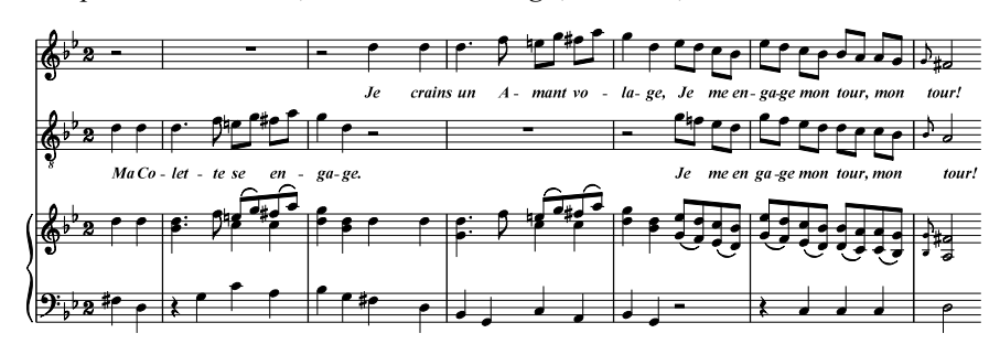
Example 16. Rousseau, Le devin du village, Scene 6, mm.17-23