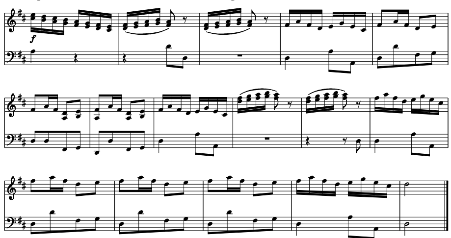
Example 4. Rousseau, Le devin du village, Overture, mm. 65-80.

The immediate impact is of rustic simplicity. Yet when these sixteen bars are laid out it in accordance with the "expected" design of four groups of four-bar phrases, a very engaging, metrically cross-rhythmic pattern emerges: