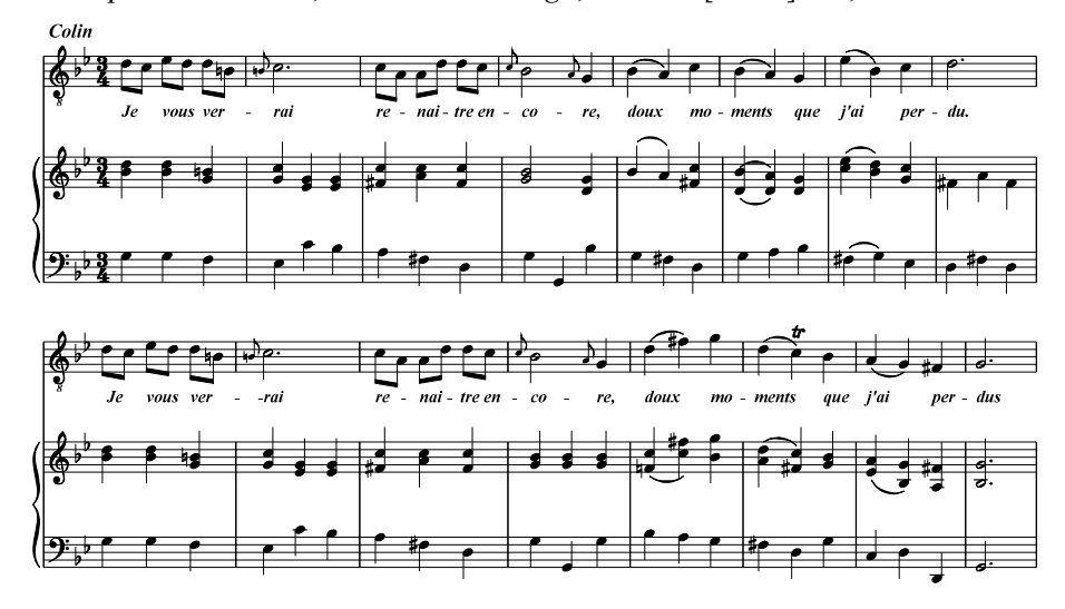
Example 7. Rousseau, Le devin du village, Scene 5 [No. 1] Air, mm. 26-41.

A single quatrain in heptasyllabic lines comprises the text to this binaryform aria: