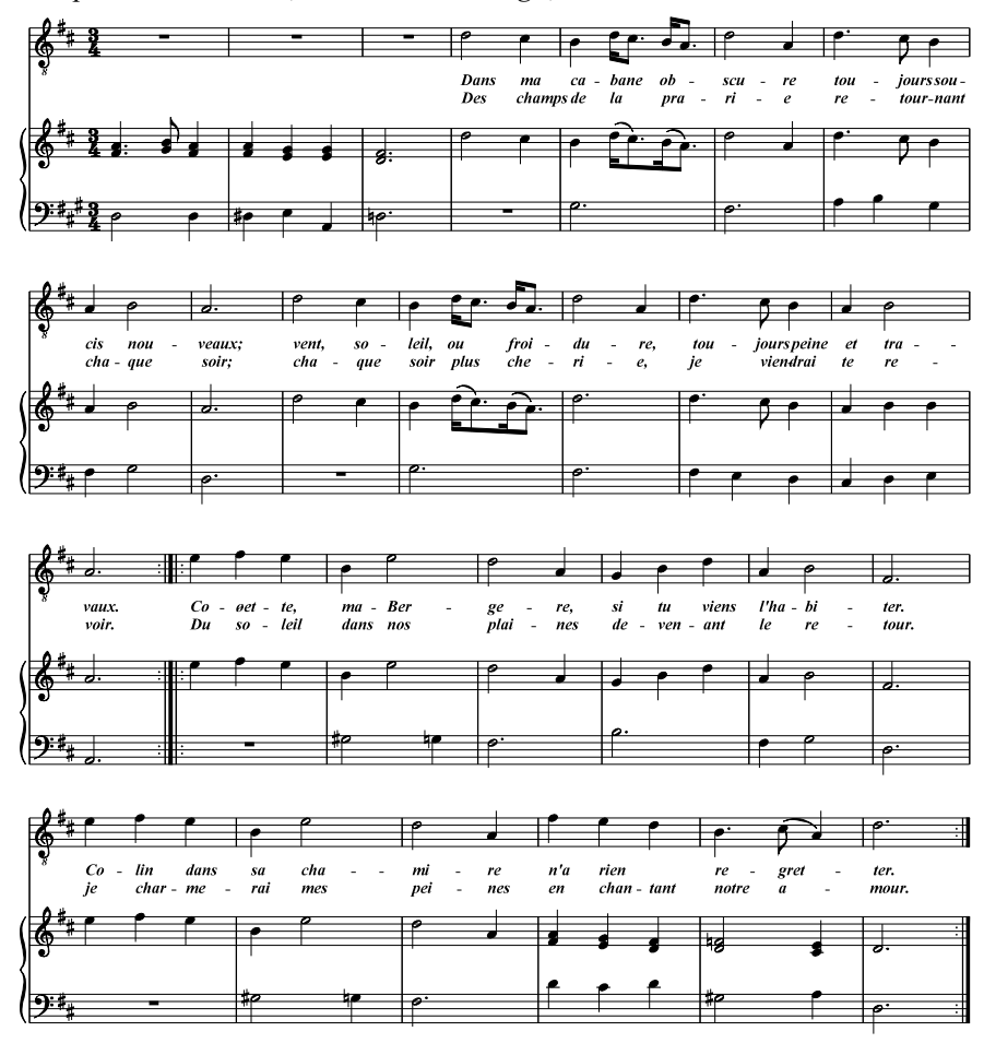
Example 11. Rousseau, Le devin du village, Scene 8 Romance.

Where, then, is the complexity? One aspect of it can be found in the way Rousseau cunningly distributes his poetic syllables. For example, one should consider mm. 4-9, which are the opening bars of the vocal melody and the model for the phrase that immediately follows. Here the six-bar phrase is comprised of two three-bar subunits, as the pattern of syllables per measure demonstrates: