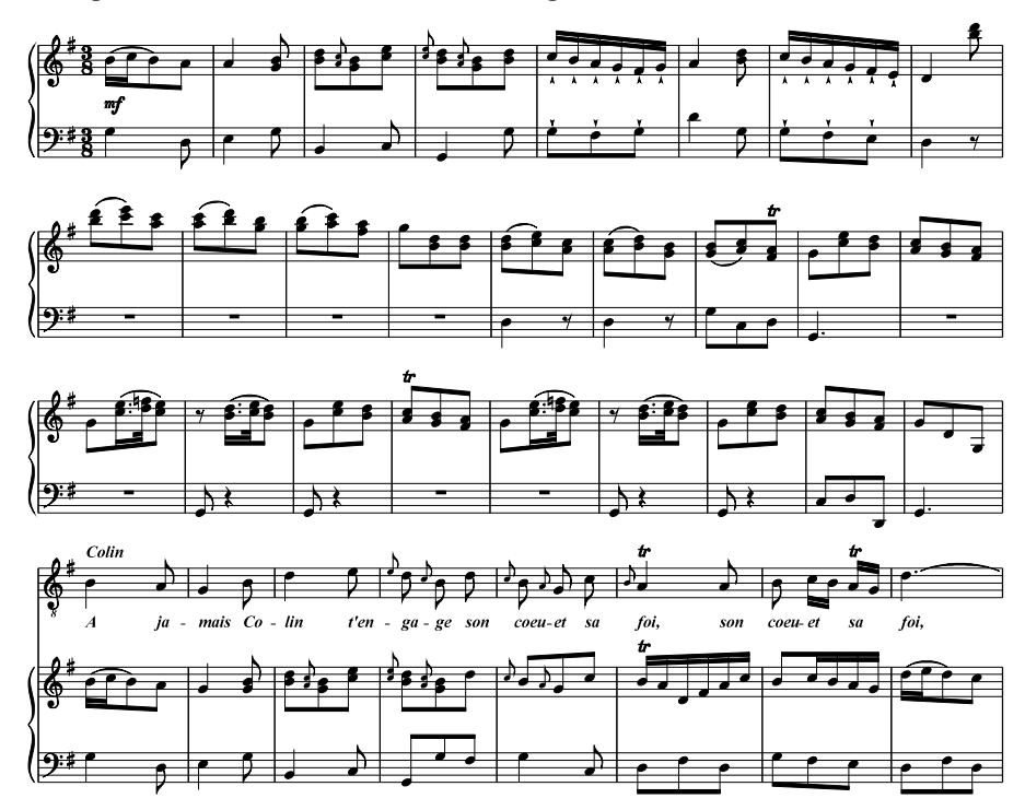
Example 15. Rousseau, Le devin du village, Scene 6, mm. 1-34.

The rhythm is typically French, yet the orchestral introduction is filled with pastoral tropes of clear Italian origin: prominent parallel thirds, as well as the use of the flattened seventh over a tonic harmony. This intermingling of national styles, while not completely original with Rousseau, was nevertheless rare. Nor is this duet atypical of the stylistic procedure of his opera; only one number earlier is another duet, "Tant qu'a mon Colin," in which Colette and Colin work out their doubts about each other, and as they do, we hear French formality in the rhythm and Italian warmth in the harmony (Example 16).