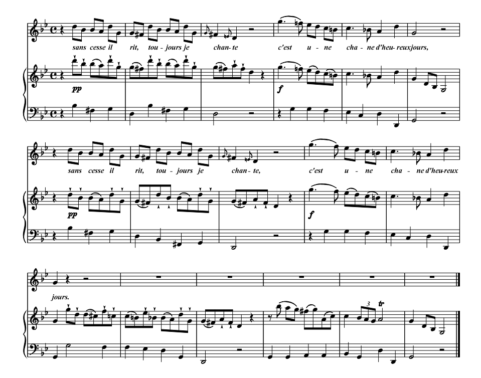
Example 10. Rousseau, Le devin du village, Scene 8 Finale, mm. 107-123.

Since it is the most celebrated piece of music in the opera, Colin's Romance deserves its own close reading. The focus, once again, is on the opposites of simplicity and complexity. Like regret and joy, these are two other values which Rousseau did not want to se severed, either in art or in life.