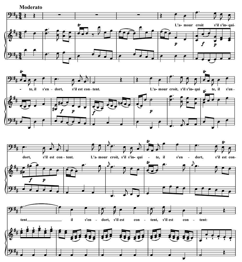
Example 6. Rousseau, Le devin du village, Scene 2 [No. 2] Air, mm. 1-28.

In his 1955 essay, "Is Beauty the Making One of Opposites," Eli Siegel asked this question under the heading "Simplicity and Complexity":