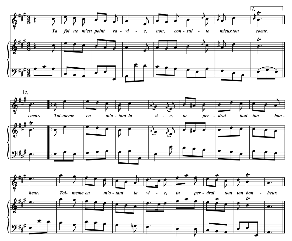
Example 8. Rousseau, Le devin du village, Scene 6 Aria, mm. 1-25.

Complex, indeed, but how simple, how "natural," it all sounds to the ear. Rousseau is asserting the equal reality of two opposite values through the symbolic language of music. He proceeds on the artistic (and ethical) assumption that we need to honor both.