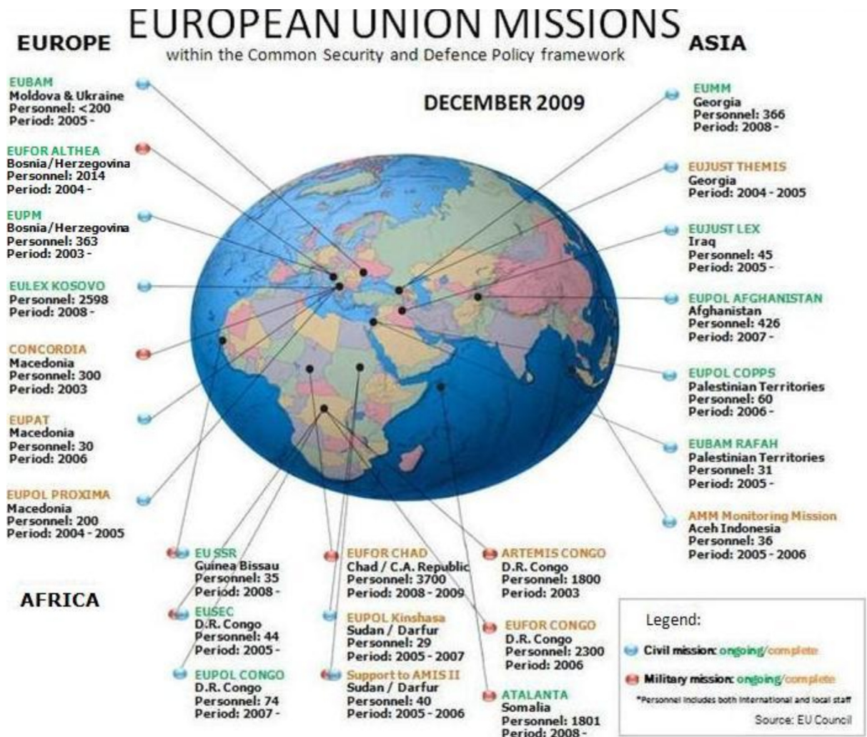
Figure 1: EU CSDP Missions

The EULEX mission deployed in Kosovo in 2008 represents the EU's largest civilian mission, while the EUFOR ALTHEA mission deployed in Bosnia and Herzegovina is for now its largest military mission. The operations the EU has conducted in the Western Balkans and the Near East are evidence of an ambition to concern itself with both its own backyard and the immediate neighbourhood. On the other hand, from 2003 to 2010, the EU has shown the ability to behave as a global actor. The ARTEMIS mission in Congo showed that the EU is capable of launching small but an autonomous military operation, independently of NATO, far from its own borders. Moreover,