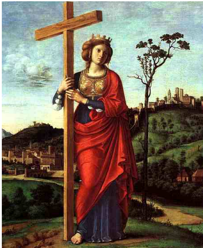
The timeless Saint Helena aged 80 with the True Cross 28

It is perfectly possible that no feast-day was involved when da Nova named the island. Several scenarios can be imagined. For example, the island may have been so named because Saint Helena is the patron saint of new discoveries. Da Nova may even have named the island after a female relative called Helena. Alexander Schulenburg suggested in 1999 that the island might not have been found on any of Saint Helena 's feast-days, but for a different reason. 27 Commenting that the island, unlike many others, has always been known by its original name, in whichever language and spelling it was written, he suggested early writers attempted to square the island's name with a suitable date. The assumption was therefore made that it was discovered on one of the feast-days of Saint Helena . He believed this was mere conjecture. He also suggested that the island was named in association with St Helena Bay in Southern Africa, which was visited and named by Vasco da Gama on 7 November 1498 and which faces the island to its northwest. If any of these possibilities are true, the date of discovery is thrown wide open.