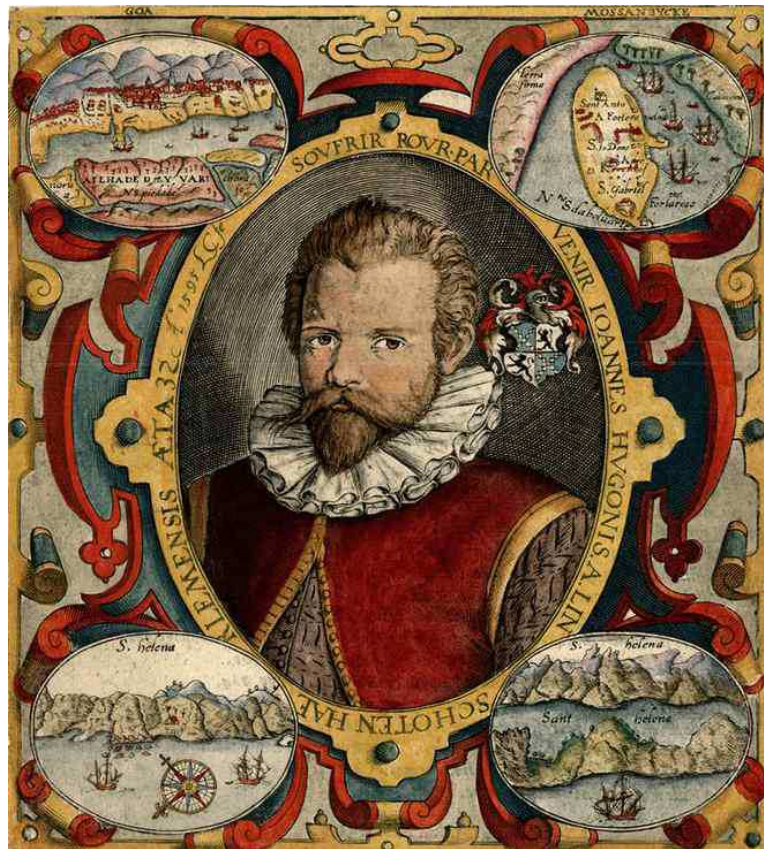
Jan Huygen van Linschoten

for the Portuguese on their home voyage from India and the Far East. Of particular relevance to St Helena Day is Linschoten's opening and closing sentences, quoted from the 1598 English translation: