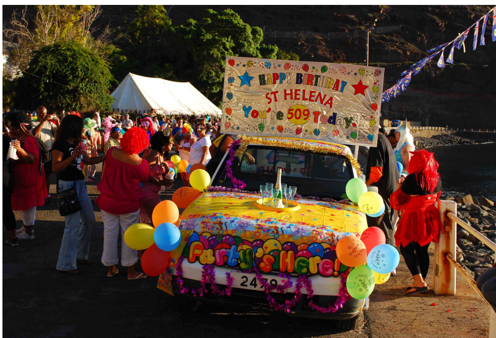
Island “birthday celebrations”, 21 May 2011

Proclaimed as a public holiday in 1945, St Helena Day on 21 May is a significant date in the island's social calendar. 1 Important events deliberately timed to occur on this national holiday include the restoration of full British passports on the island's quincentenary in 2002 and the forthcoming official opening of the new airport in 2016. 2 For the past nine years, much of the day's festivities have been organised by the New Horizons youth group with parades, raffles, market stalls, music and fireworks. It is likewise observed by Saints overseas, congratulations are sent each year from other Overseas Territories and organisations such as the RSPB and Kew Gardens, whilst the Foreign and Commonwealth Office also occasionally remember the day when it flies the island flag above its building. 3