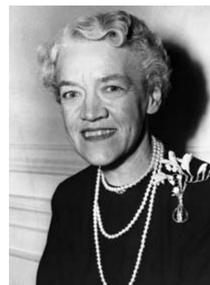
Margaret Chase Smith, elected 1952.