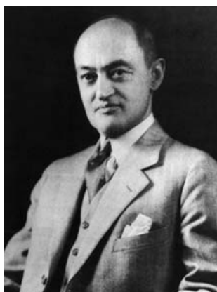
Joseph Alois Schumpeter, elected 1933.