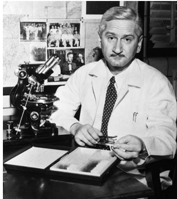
Albert Bruce Sabin, elected 1955.

Election: 2000, Fellow Affiliation at election: University of California, Los Angeles Residence at election: Los Angeles, CA Career description: Historian; Educator Current affiliation: Same