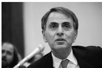
Carl Edward Sagan, elected 1978.