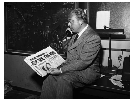
Leo Szilard, elected 1954.