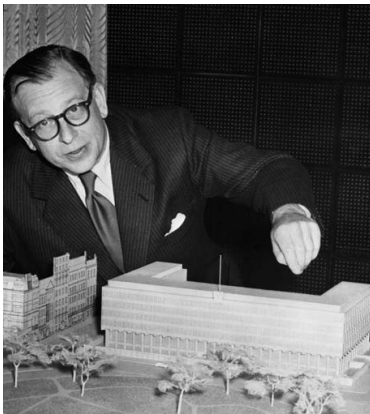
Eero Saarinen, elected 1954.

Election: 2012, FHM Affiliation at election: Paris, France Residence at election: Paris, France Career description: Musician (composer) Current affiliation: Same