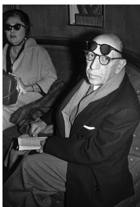
Igor Fyodorovich Stravinsky, elected 1940, FHM.