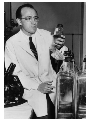
Jonas Edward Salk, elected 1966.