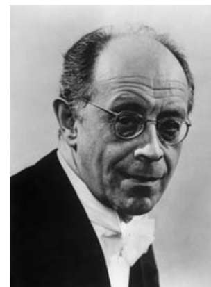
Rudolf Serkin, elected 1960.