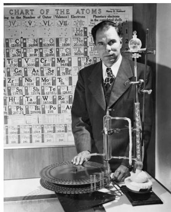
Glenn Theodore Seaborg, elected 1958.