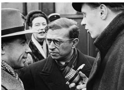
Jean-Paul Sartre, elected 1960, FHM.

Current affiliation: Columbia University