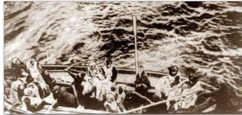
■ Titanic survivors about to be rescued by the Carpathia.

At this point less than 15 minutes remained and hundreds of people were gathering on the steeply inclined decks. Many passengers, finally freed from below and from Third Class, found all of the boat davits empty and not a lifeboat in sight. The Titanic 's orchestra was on deck playing ragtime melodies for the crowd of passengers. An Irish priest was hearing confessions near the fantail. Anguish permeated the atmosphere along with a sense of hopelessness and the certainty of imminent and horrific death.