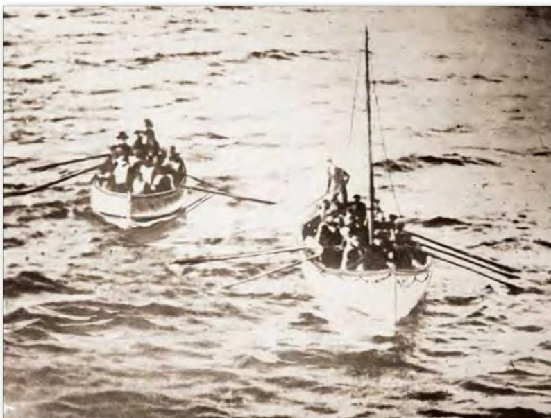
■ Fifth Officer Lowe being very capable had set sails on Lifeboat Number 14 and towed a collapsible. Lowe was one of the few to return to the scene and attempt to rescue more survivors.