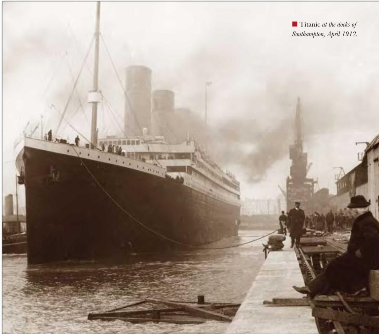
■ Titanic at the docks of Southampton, April 1912.