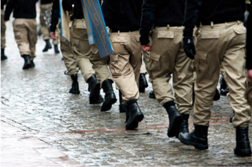
Neo-Nazis in Karlskrona.