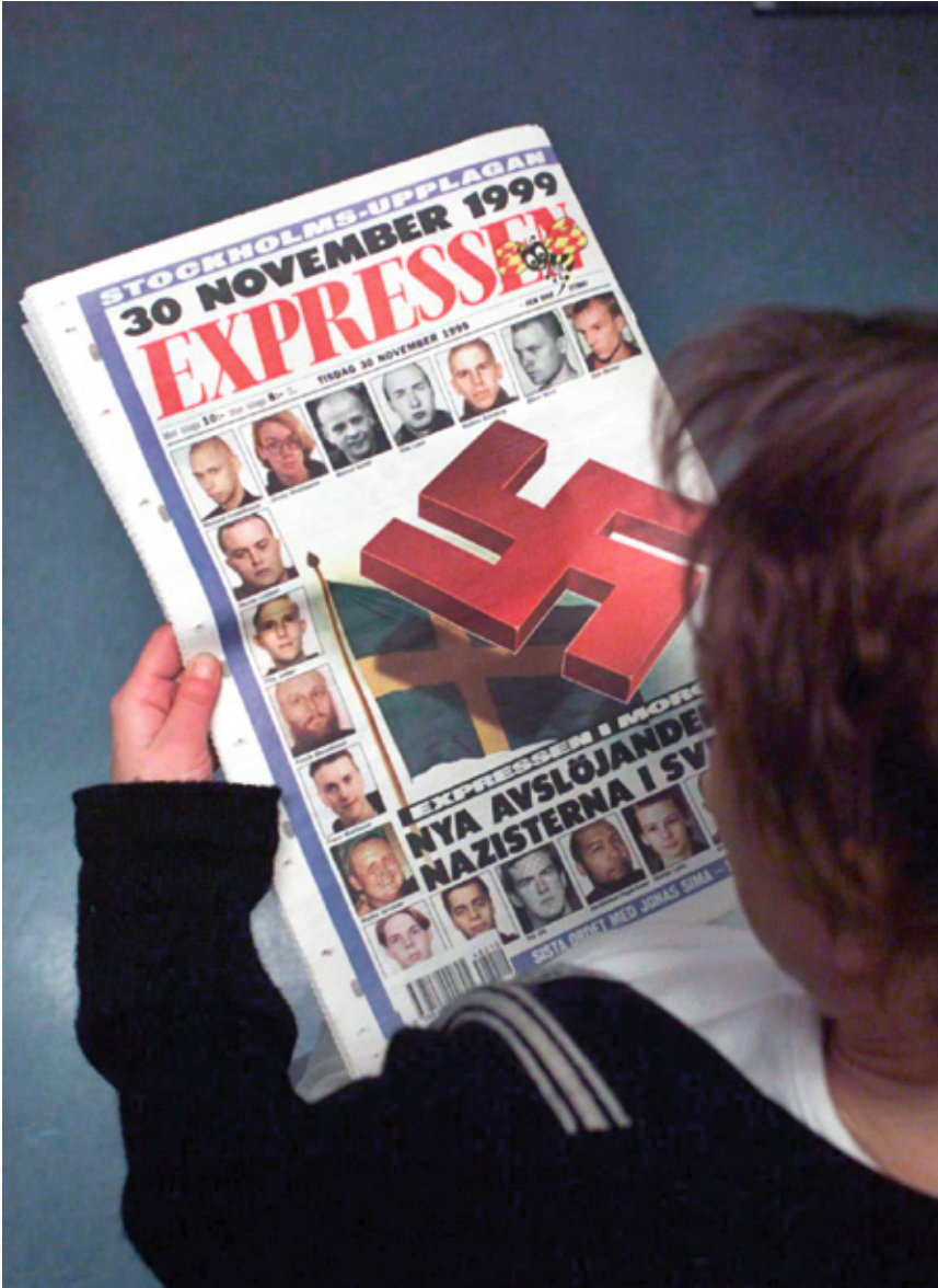
On November 30, 1999 the Swedish Newspaper Expressen, acting jointly with three other major papers in Sweden, publishes the names and photographs of 62 Neo-Nazis who had been convicted or indicted on criminal charges, or were classified as "agitators."