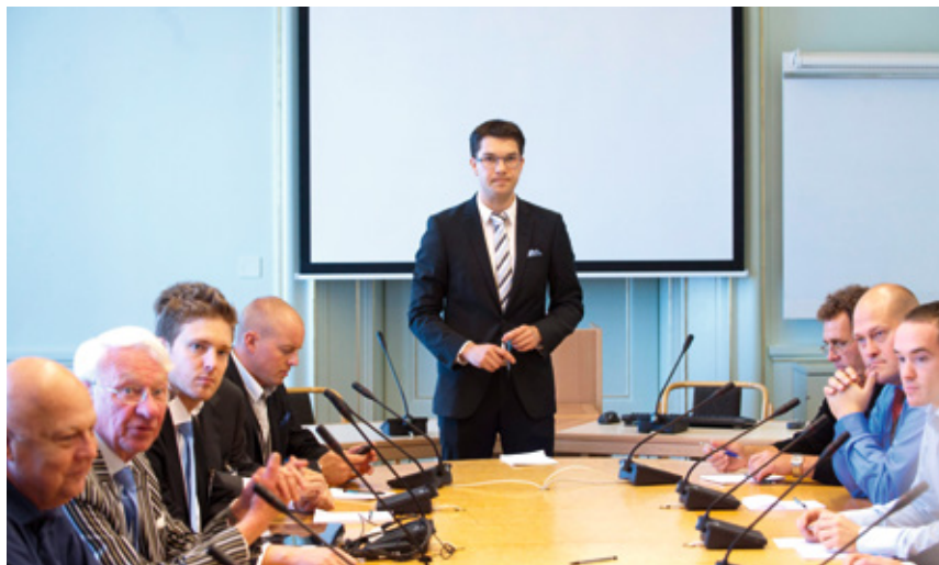
First meeting of the right-wing populist party Sweden Democrats.