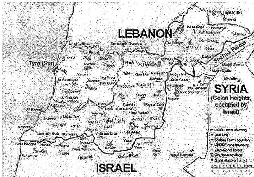
Fig. 1 – United Nations Blue Line