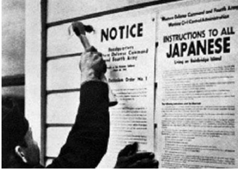
Soldiers and police posted President Roosevelt's February 19, 1942 Executive Order #9066 requiring the expulsion of Japanese Americans from the West Coast. Posters included euphemisms like "evacuation" and "Assembly Centers".