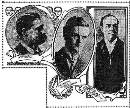
Headline from the San Francisco Chronicle on March 3, 1905.

While many of the 19th century Japanese visitors to the U.S. were sojourners seeking adventure, education, and even economic opportunities, little did they anticipate that if they decided to stay permanently in this country, any move towards naturalization would be barred by an Act of Congress passed in 1790, which allowed only ‘free white men’ to be naturalized (Chuman, 1976). The Chinese Exclusion Act of 1882 aided (by favoring) Japanese immigration to America, but not for long (Takaki, 1989). In early 20th Century, California passed its Alien Land Law (1913), which used the indefinite alien status of Japanese and other Asians to prevent them from acquiring real estate, and setting down permanent roots. The California law was soon mimicked by other western states (Chuman, 1976). Japanese and other Asian immigration was finally turned off by the passage of the U.S. Immigration Exclusion Act of 1924. Japanese immigration was halted until the 1952 passage of the McCarran-Walter Act. This historic act allowed Issei (Japanese immigrants) to become naturalized for the first time and allowed immigration to resume (at 185 Japanese persons per year), now without constraints to a person’s country of origin (Maki, Kitano, & Berthold, 1999).