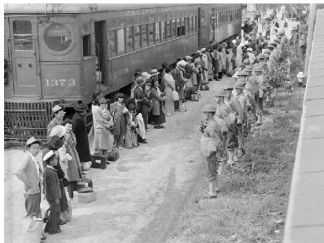
Japanese Americans from San Pedro, California, guarded by soldiers arrive at Santa Anita Race-track, a temporary detention center, in Arcadia, California, in 1942.

Definitions —a euphemism is “a mild word or expression substituted for one considered blunt and embarrassing” (Chantrell, 2002, p.186). It comes from the Greek euphemismos, from euphemizein ‘use auspicious words’. The formative elements are eu “well” and pheme “speaking” (English usage since late 16th century) (Chantrell, 2002). In more modern times, author William Safire (1981) writes: “To some degree, euphemism is a strategic misrepresentation” (p. 82).