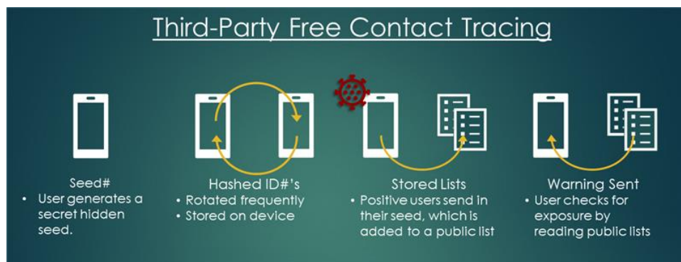
Figure 2: PACT Tracing Protocol. First, a user generates a random seed, which they treat as private information. Then all users broadcast random-looking signals to users in their proximity via Bluetooth and, concurrently, all users also record all the signals they hear being broadcast by other users in their proximity. Each person’s broadcasts (their “pseudonyms”) are a function of their private seed, and they change these broadcasted pseudonyms periodically (e.g. every minute). Whenever a user tests positive, the positive user then can voluntarily publish, on a public server, information which enables the reconstruction of all the signals they have broadcasted to others during the infection window (precisely, they publish their private seed, and, using the seed, any other user can figure out what pseudonyms the positive user has previously broadcasted). Now, any other user can determine whether they are at risk by checking whether the signals they heard are published on the server. Note that the “public lists” can be either lists from hospitals, which have confirmed seeds from positive users, or they can be self-reports (see Section 2.3). Credit: M Eifler.

“If you do not report as being positive, then no information of yours will leave your phone.” From a more technical standpoint, the statement that is consistent with our protocols is: