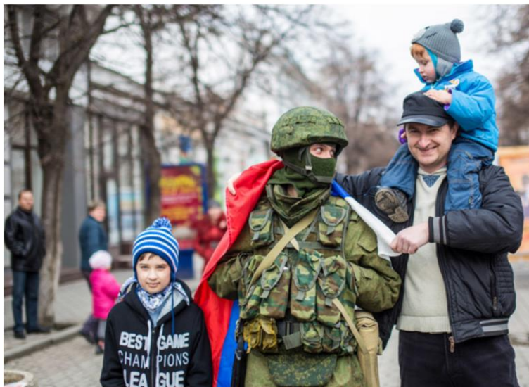
Figure 5: Screenshots of Images and Captions from RT Article about Crimea (March 2, 2014)

Armed conflict seems to be the last thing on these locals' minds, as self-defense forces provide a welcome if not unexpected change.