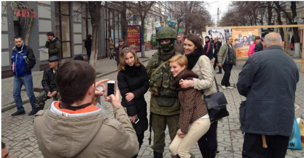
Figure 4: Screenshot of RT Article about Crimea (March 2, 2014)

As evidence of this ‘chaos’ and alleged ‘humanitarian catastrophe’, RT zeroed in on the Ukrainian parliament’s repeal of a 2012 law that conferred official status to any given language in a given region spoken by at least 10% of the local population. The law disproportionately affects the Russian language – which meets this criterion in almost half of Ukraine’s oblasts – and its abrogation thus elicited vehement condemnation from Russia as being “a brutal violation of ethnic minority rights”. 58 Many Western leaders also criticised the parliament’s decision, and it was ultimately vetoed by then-