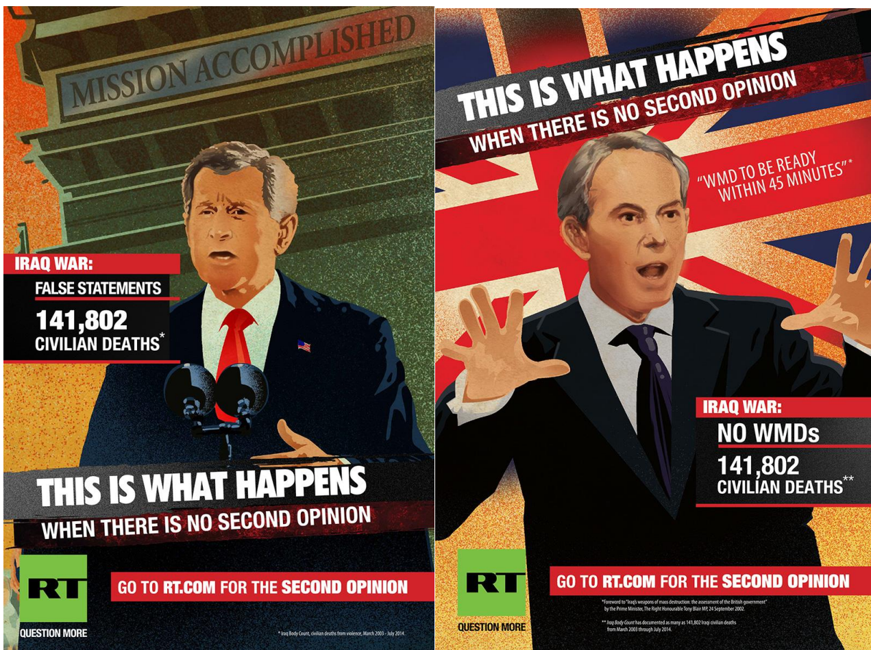
Figure 1: RT's Conspiratorial Advertisements about the Iraq War

RT's conspiratorial ethos is encompassed by its slogan, 'Question More', which was introduced in 2010 by way of a highly provocative advertising campaign. 48 The ads involved superimposed, incongruous images accompanied by conspiratorially suggestive questions – for example, one poster asked 'Who poses the greater nuclear threat?' with superimposed portraits of US President Barack Obama and Iranian leader Mahmoud Ahmadinejad. Another fused images of a polar bear and an alien with the caption, 'Climate change: science fact or science fiction?' (see Figure 2 below). These ads are extremely savvy: one of the 2010 billboard posters even won the British Awards for National Newspaper Advertising 'Ad of the Month'. 49 Indeed, part of what makes RT's brand of propaganda and disinformation so shrewd and difficult to counter is its perversion of traditional liberal-democratic principles of free speech, critical journalistic inquiry, and independent thought. The slogan 'Question More' sounds very compelling at first blush: it appears to advocate media literacy, encouraging people to think critically and to maintain a healthy scepticism about media content. But the underlying message is in fact far more pernicious and manipulative, suggesting that any mainstream narrative in the news cannot be trusted because it has been planted by the government or