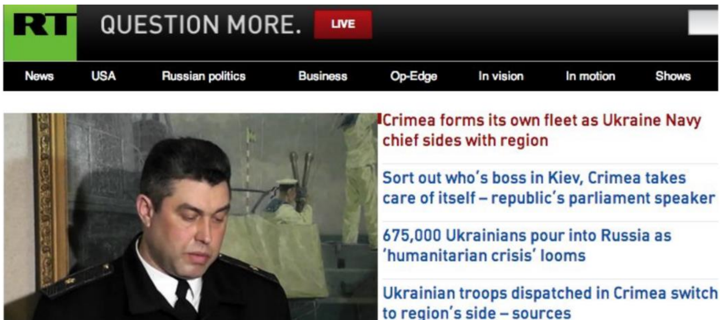
Figure 3: Screenshot of RT News Headlines (March 2, 2014)

Since the early days of the Ukraine crisis, RT has been at the helm of Russia’s efforts to influence international public opinion about its annexation of Crimea and to obfuscate its role in the conflict. In the first days of March 2014, before Russia officially annexed Crimea but after ‘little green men’ – Russian troops bearing no insignia – took over the Supreme Council of Crimea, RT was already working feverishly to set the stage for the impending takeover, reporting that Crimea could ‘take care of itself’ without governance from Kiev, and that hundreds of thousands of Ukrainians were fleeing to Russia ‘as humanitarian crisis looms’ (see Figure 3). 54 On March 2, 2014, RT ran a story titled “Tea, sandwiches, music, photos with self-defense forces mark peaceful Sunday in Simferopol” (see Figure 4). 55 These are the same ‘self-defence forces’ that later turned out to be Russian military servicemen in unmarked uniforms who were deployed by Moscow to capture strategic locations in Crimea in preparation for annexation. The story includes a series of photographs of locals posing enthusiastically with the troops, with captions emphasising Crimea’s apparent stability and goodwill towards Russia – e.g., “Armed conflict seems to be the last thing on these locals’ minds, as self-defense forces provide a welcome if not unexpected change” (see Figure 5).