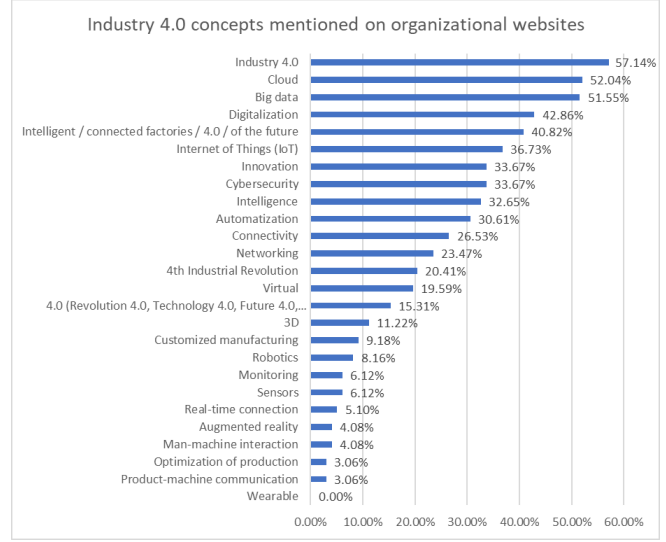
Fig. 2. Industry 4.0 concepts mentioned on organizational websites.

As seen from Fig. 2 the most repeated concepts on the webs are big data, digitization, internet of things and cloud computing, which are perhaps the most well-known among the general public.