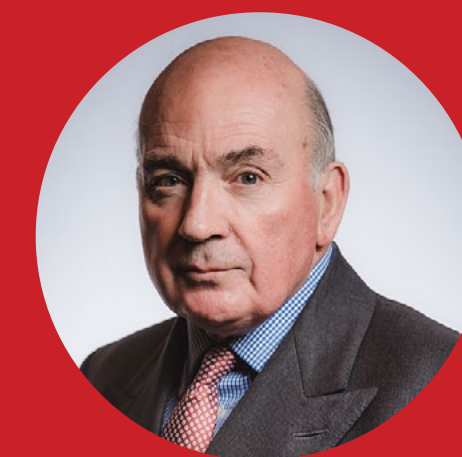
Richard Dannatt General The Lord Dannatt, Chairman, National Emergencies Trust