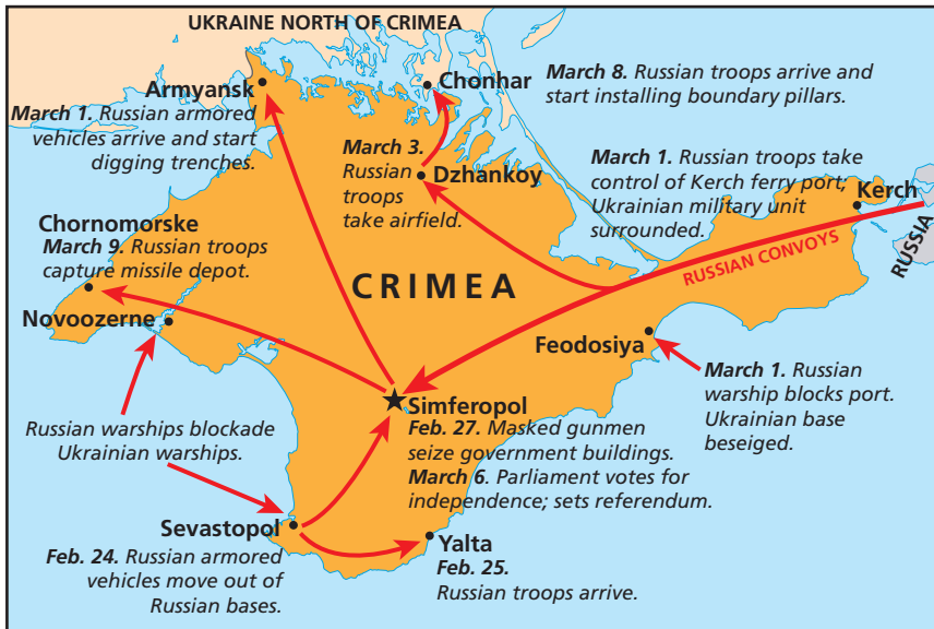
Figure 2.1 Map of Crimea and Russian Operations, March 2014

On February 24, the city council in Sevastopol installed a Russian citizen as mayor, and several units from the 810th Naval Infantry arrived in the city square in armored personnel carriers (APCs), in violation of the rules governing basing arrangements in Crimea. 5 This was the first tangible sign that Russia had decided to intervene militarily to change the political order on the peninsula. On February 25, the Nikolai Filchenkov , an Alligator-class landing ship carrying 200 Rus-