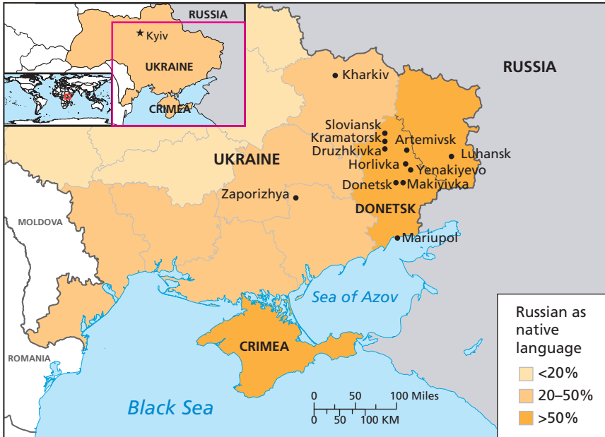
Figure 3.1 Map of Eastern Ukraine