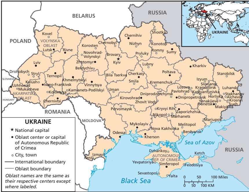
Figure 1.1 Map of Ukraine