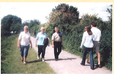
Kennet & Avon canal towpath