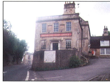
Bathford, the Post Office

b Interest route – (0.5 miles) below Post Office ➔ left Church Street and follow map. (At Pump Lane 📍 drinking fountain) ➔ view of church ➔ right by Vicarage ➔ hill (Ostlings Lane) (✓ no pavement -