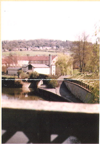
The Bath skyline walk viewed From Halfpenny Bridge. In the centre, the Kennet and Avon canal enters the Avon river.