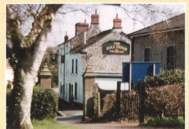
The Full Moon public house in Twerton, start of the riverside walk into city centre