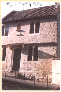
The Magdalene Chapel in the Holloway, started in the 12th century and later used as a Hospital.