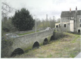
Lock Keeper Pub and original road

i After 100 yards on the left, just inside the main gates to the Somerdale development, is a fenced area with information and artefacts from the Roman villa found when the site was developed. B