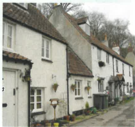
Hanham Mill cottages

As a detour, it is possible to walk the 0.5 mile downstream to HANHAM MILL and back, passing the remains of a once thriving coal mine.