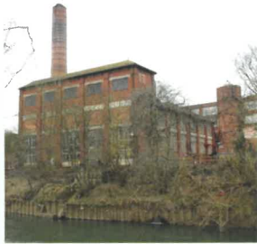
Cadbury's Factory building

Turn RIGHT and take the footpath by the side of the LOCK KEEPER pub past the River Avon Trail information board, going under the road bridge and on along the tow path on the side opposite the former Cadbury's Factory buildings. C D E