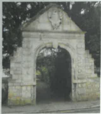
Stone arch on Station Rd

i Note stone arch on the right leading to Parkhouse thought to be from Keynsham Abbey. A