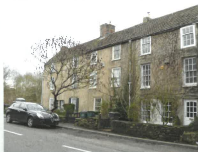
Former Hat factory

10 At the Mill turn RIGHT into the wildlife garden. Continue through the garden with Siston Brook on the left to the main road. Cross the road, turn LEFT and follow the road to the mini roundabout. K