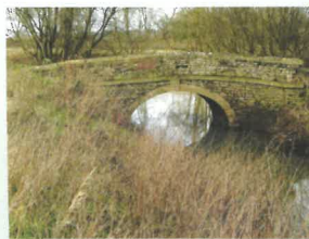
Londonderry Wharf bridge

2 After about half a mile, the path bears LEFT over a stone bridge at LONDONDERRY WHARF . F