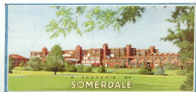
Picture taken of 1935 souvenir tin - shows Fry's Chocolate Factory

13 Return to KEYNSHAM CHURCH , up the hill past Keynsham Station. On the right, opposite the station car park, notice the old iron gates which once gave access to FRY'S Chocolate Train.