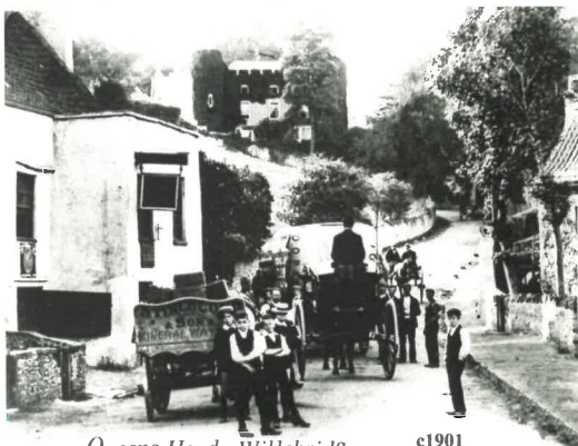
Queens Head Willsbridge. c1901