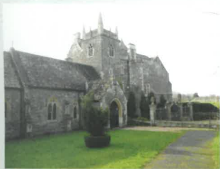
Hanham Court and Church

4 Go past Hanham Lodge and turn RIGHT through an arch following the path for 100 yards to the church lane. Turn RIGHT to Hanham Court and Church. H