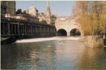
The Weir at Pulteney Bridge

The original weir was in place when there were several mills in the area to provide water power for the cloth trade, which was Bath's chief industry. The present weir of 1971 was designed purely for artistic affect. The flood barrier was built in the 1970's.