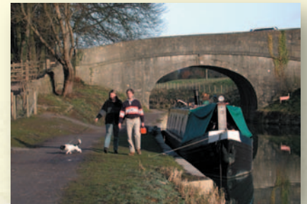
Stone Bridge over Kennet & Avon Canal

Ralph Allen commissioned this folly to provide employment for local stonemasons and improve the view from his home in Lilliput Alley.