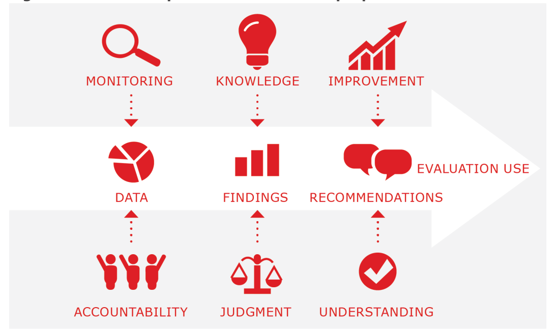
Figure 1. Relationship between evaluation purpose and evaluation use

As highlighted in the previous examples, the evaluation purpose can have a direct effect on how evaluation data are applied and used. Often, the desire is for evaluation recommendations and findings to inform decision making and lead to program improvement. Alternatively, evaluation results may be used to support or justify a preexisting position, which results in little to no programmatic change. The following diagram shows how a range of evaluation purposes can influence the use of data, findings, and recommendations. As illustrated in the figure below, data can be used for monitoring or accountability, depending upon your purpose. Similarly, recommendations can be used for program improvement.