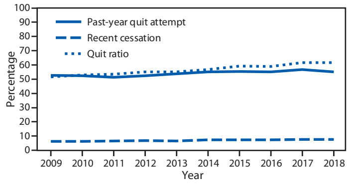
FIGURE 2. Prevalence of past-year quit attempts* and recent cessation<sup>†</sup> and quit ratio<sup>§</sup> among cigarette smokers aged ≥18 years — National Health Interview Survey, United States, 2009–2018