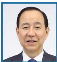
Wang Yu, MD, PhD

Fontaine 博士, 现任CDC 全球健康保护司高级顾问。自 1973 年开始在 CDC 工作, 并于 1974 年首次在海外服务于印度的天花根除工作。从1987 年, 他开始在沙特阿拉伯、约旦和中国 (2004-2012 年) 担任常驻顾问, 发展现场流行病学培训项目。在中国, 他帮助培养了 160 多位流行病学家。为表彰其成就, 中国政府给Fontaine博士颁发了友谊奖。