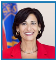
Rochelle P. Walensky MD, MPH

Director, Centers for Disease Control and Prevention