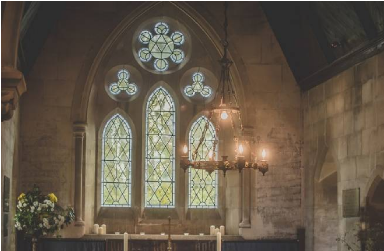
Marriage after divorce