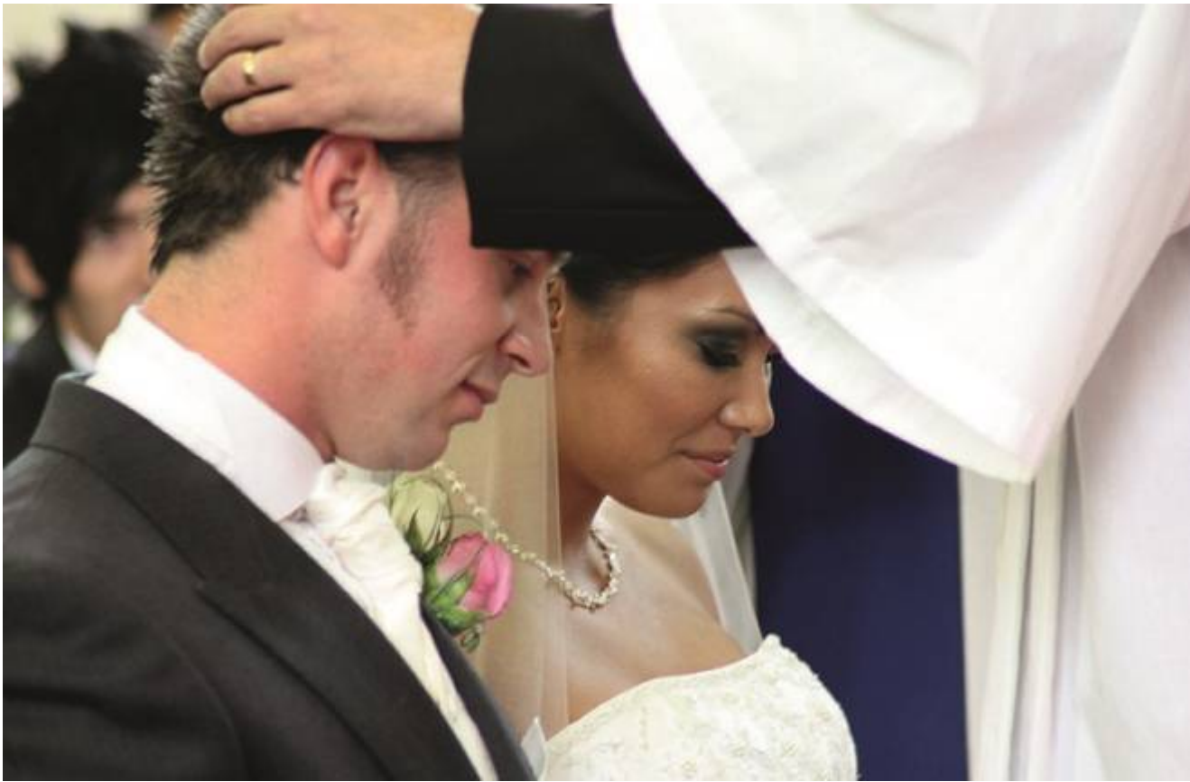
Seven steps to a heavenly wedding