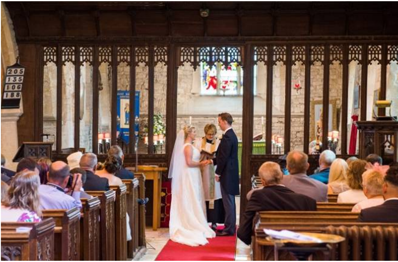
More than a wedding venue