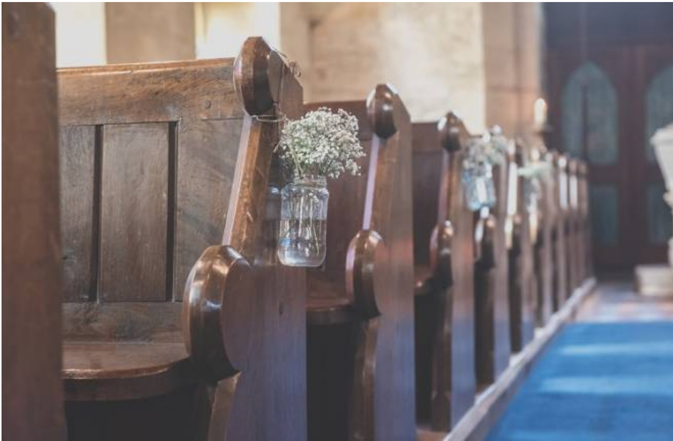
Booking a church