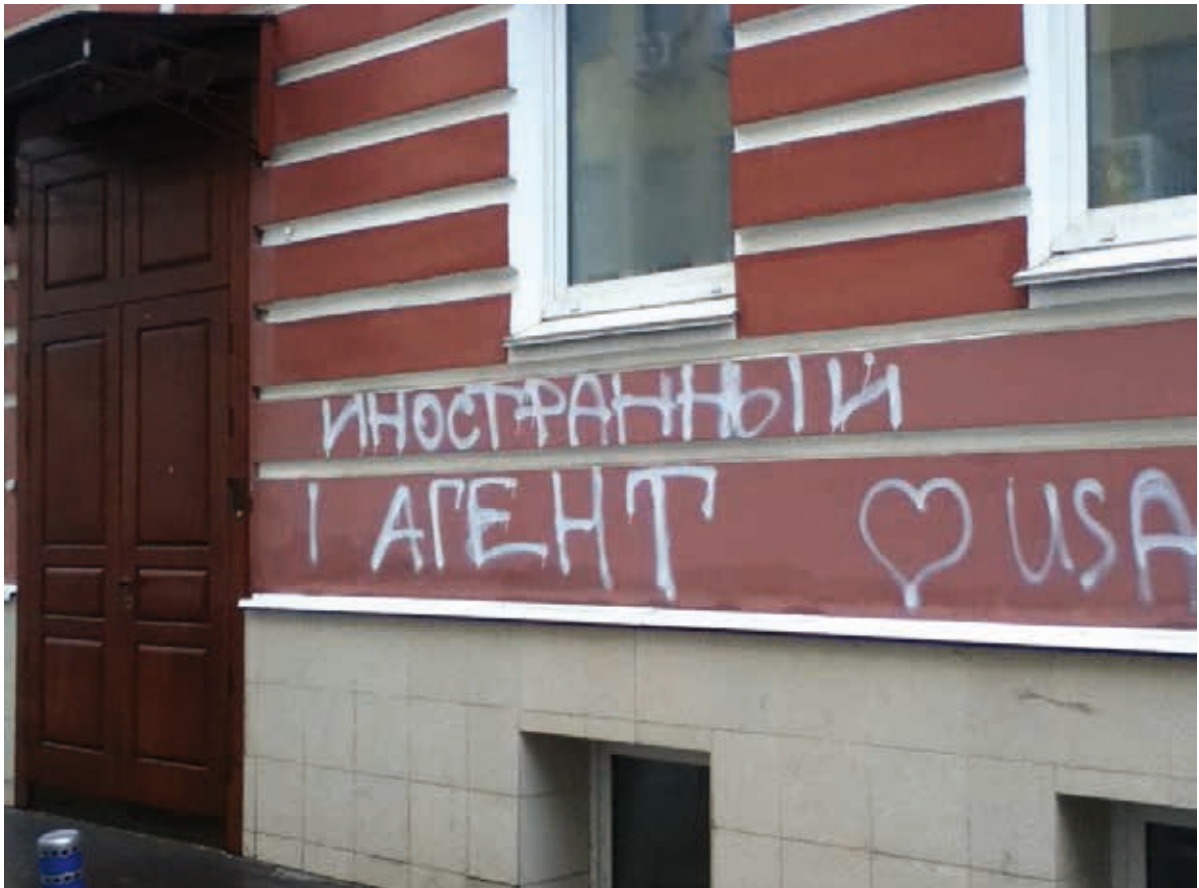
The spray-painted words "Foreign Agent! ♥USA" on the façade of the International Memorial office building.