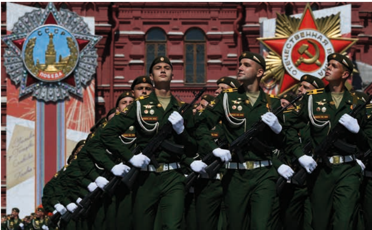
Servicemen march on the Red Square in Moscow during the military parade on May 9, 2020. Despite the rapid spread of the newly discovered Covid-19 virus, the Kremlin did not cancel the commemoration of the 75th anniversary of Victory in the Second World War.