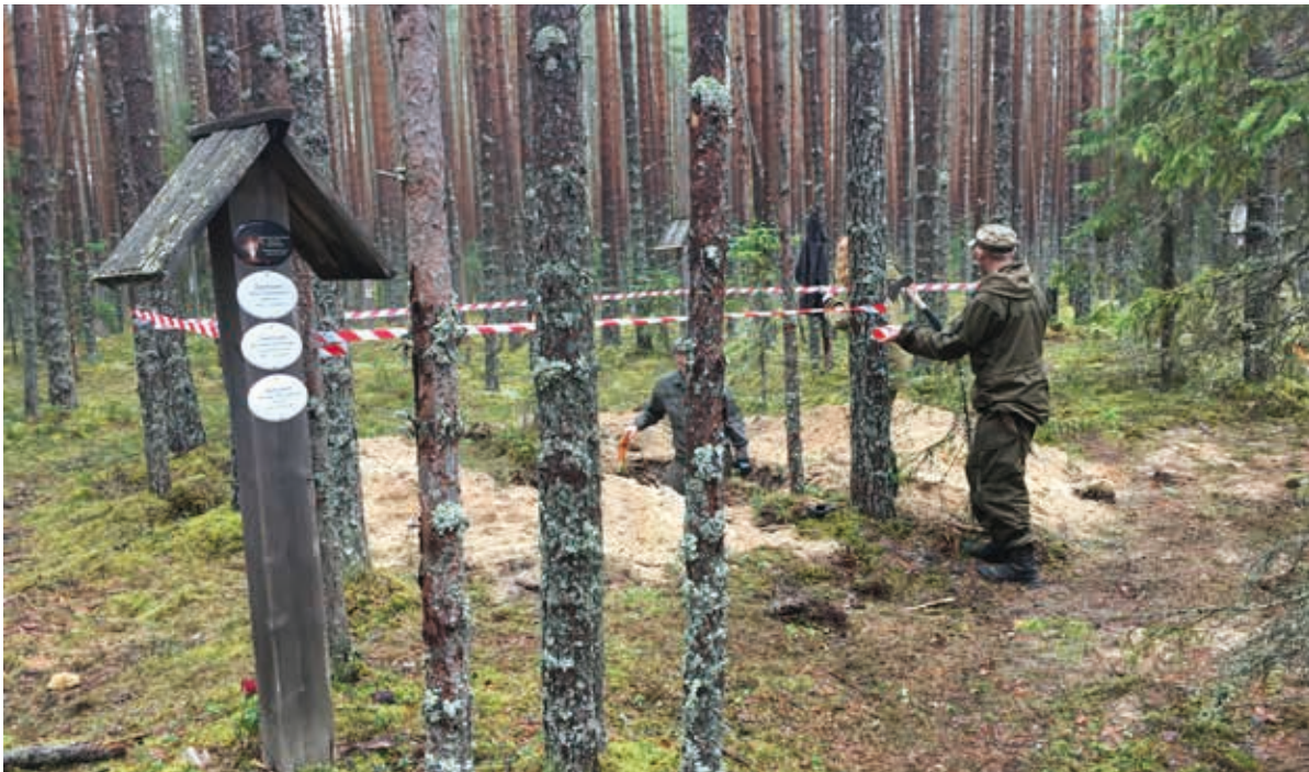
Searchers from the Russian Military Historical Society complete excavations in the Sandarmokh tract, the site of mass shootings during the “Big Terror.” late August 2018