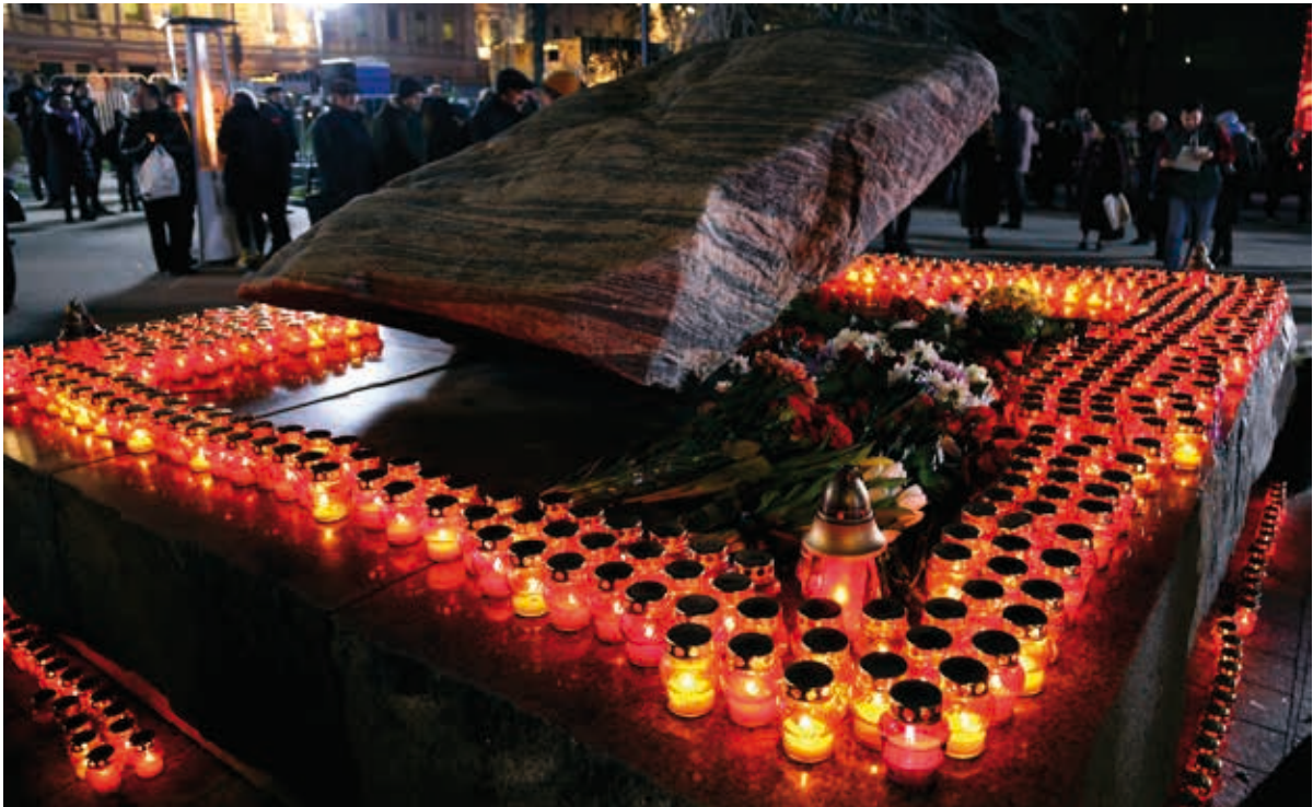
The memorial in Lubyanka Square, during the recent Return of the Names ceremony?

housing is arguably the only meaningful reparation prescribed by Russia's domestic law. However, even that remedy has so far remained inaccessible to the victims, with the judgment of the Constitutional Court in their favour still awaiting implementation (see § 129 above).