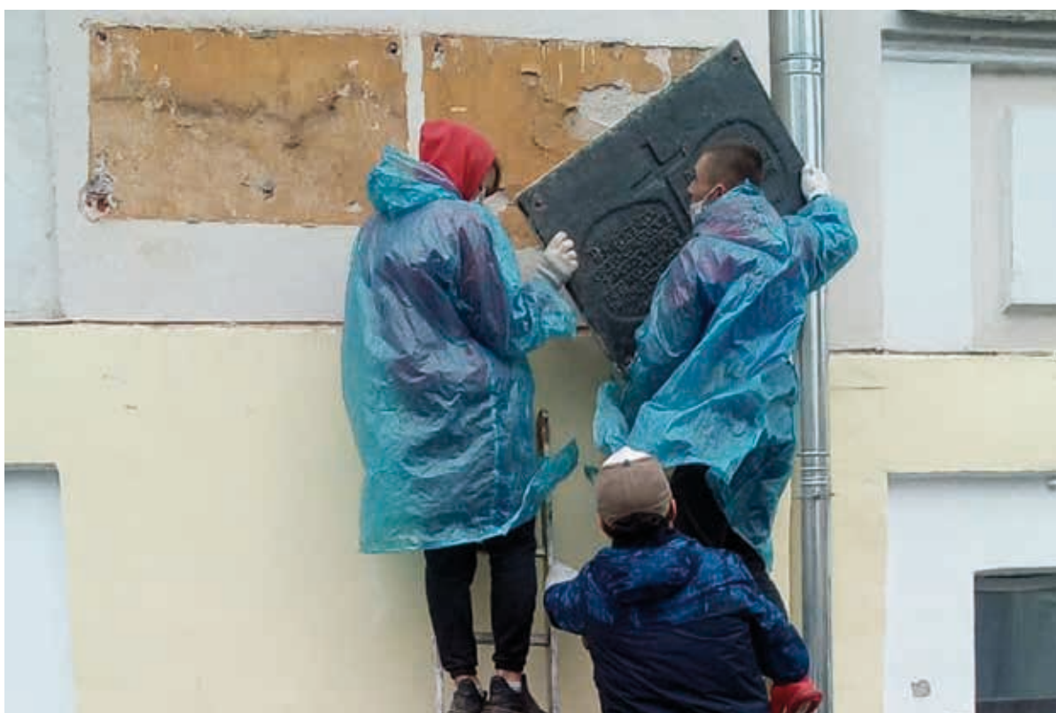
The dismantling of the plaques commemorating the victims of the Great Terror and the Katyń massacre in Tver, May 2020.