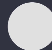
Vacant LOCAL ECONOMY