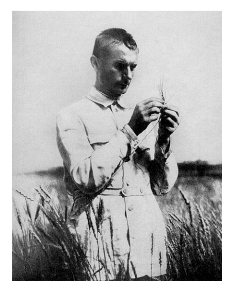
Fig. 7. Trophim Lysenko, 1898–1976.