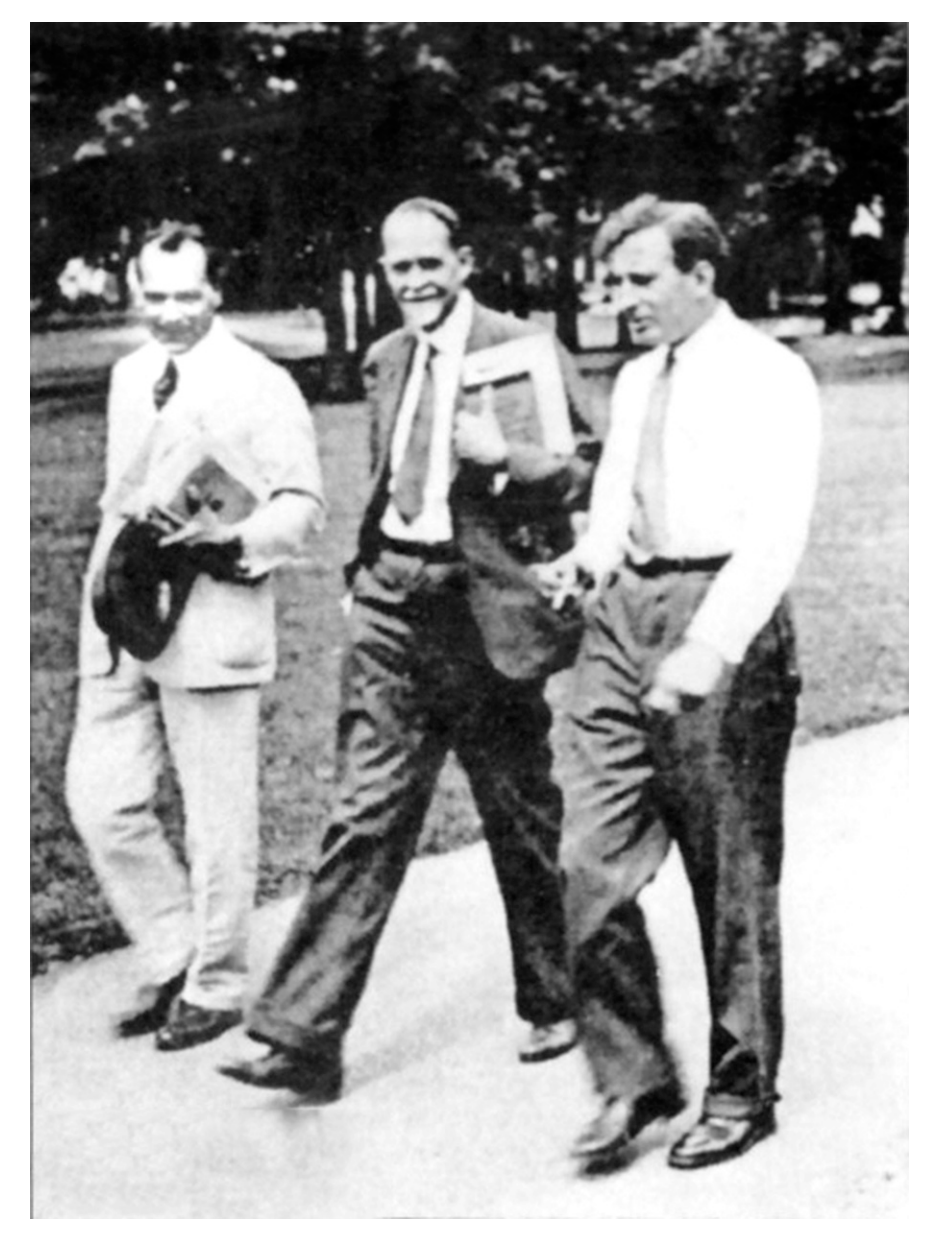
Fig. 5. Vavilov with Thomas Hunt Morgan and Nicolay Timofeyev-Ressowsky at the Sixth International Genetics congress in Ithaca, NY.

At the famous All Russian Genetics Congress held in Leningrad in 1929, a paper by Trofim Lysenko (Fig. 7) entitled Concerning the essence of the winter habit brought Lysenko into prominence. Although what was to be dubbed vernalization had been long a subject of physiological study in the