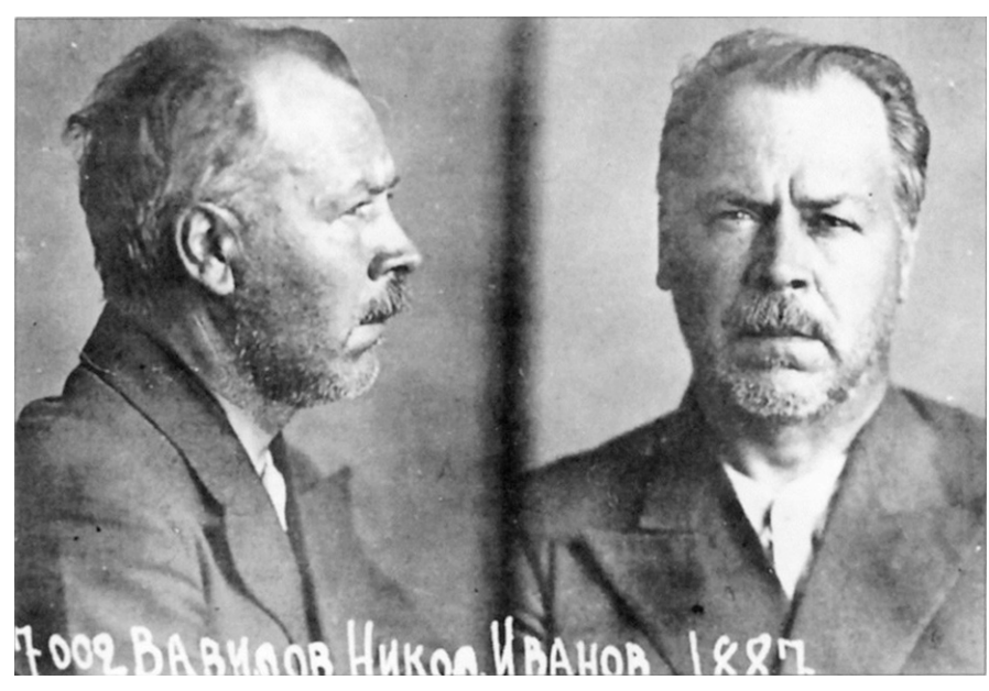
Fig. 8. Mug shot of Vavilov after arrest in 1940.