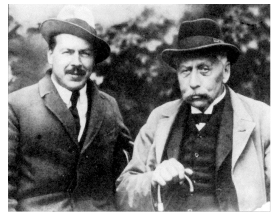
Fig. 3. Vavilov and William Bateson, 1913.

The origin of cultivated plants drew his attention, and an early work entitled On the Origin of Cultivated Rye was published in 1917, incorporating linguistic analysis. This work presaged Vavilov's main contribution expounded in 1926, and published as The Centers of Origin of Cultivated Plants. It was appropriately dedicated to Alphonse De Candolle, Swiss botanist and early plant geographer and author of the pre-genetic and pre-cytological classic, The Origin of Cultivated Plants (1880), which predicted that cultivated plants originated in areas inhabited by their wild relatives. Vavilov later expanded his concept in a book entitled Theoretical Basis of Plant Breeding (1935). He noted that the success of breeders such as Ivan V. Michurin, Luther Burbank, and Niels Hansen were based on their use of exotic germplasm from distant regions. Eight Centers of Diversity were enumerated: I. China, II. India and Indo-Malaya, III. Central Asia, IV, Near East, V. Mediterranean, VI. Abyssinia, VII. South Mexico and Central America, and VIII, South America (Peru, Ecuador, Bolivia). His centers were refined and regrouped as new findings were made. Vavilov was honored for this work with the Lenin prize, and named as a foreign member of the Royal Society of London.