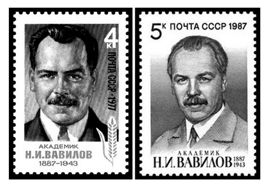
Fig. 10. Vavilov honored in Russian postage stamps after his posthumous official rehabilitation in the Soviet Union.

who adhered to it were to be burned unless they retracted.