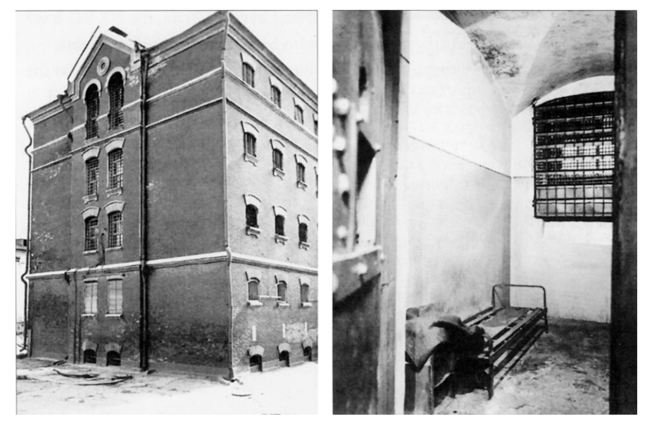
Fig. 9. Saratov prison and cell of Vavilov where he died in 1943 of cardio vascular failure and dystrophy at the age of 55, undernourished and sick as a result of solitary confinement.