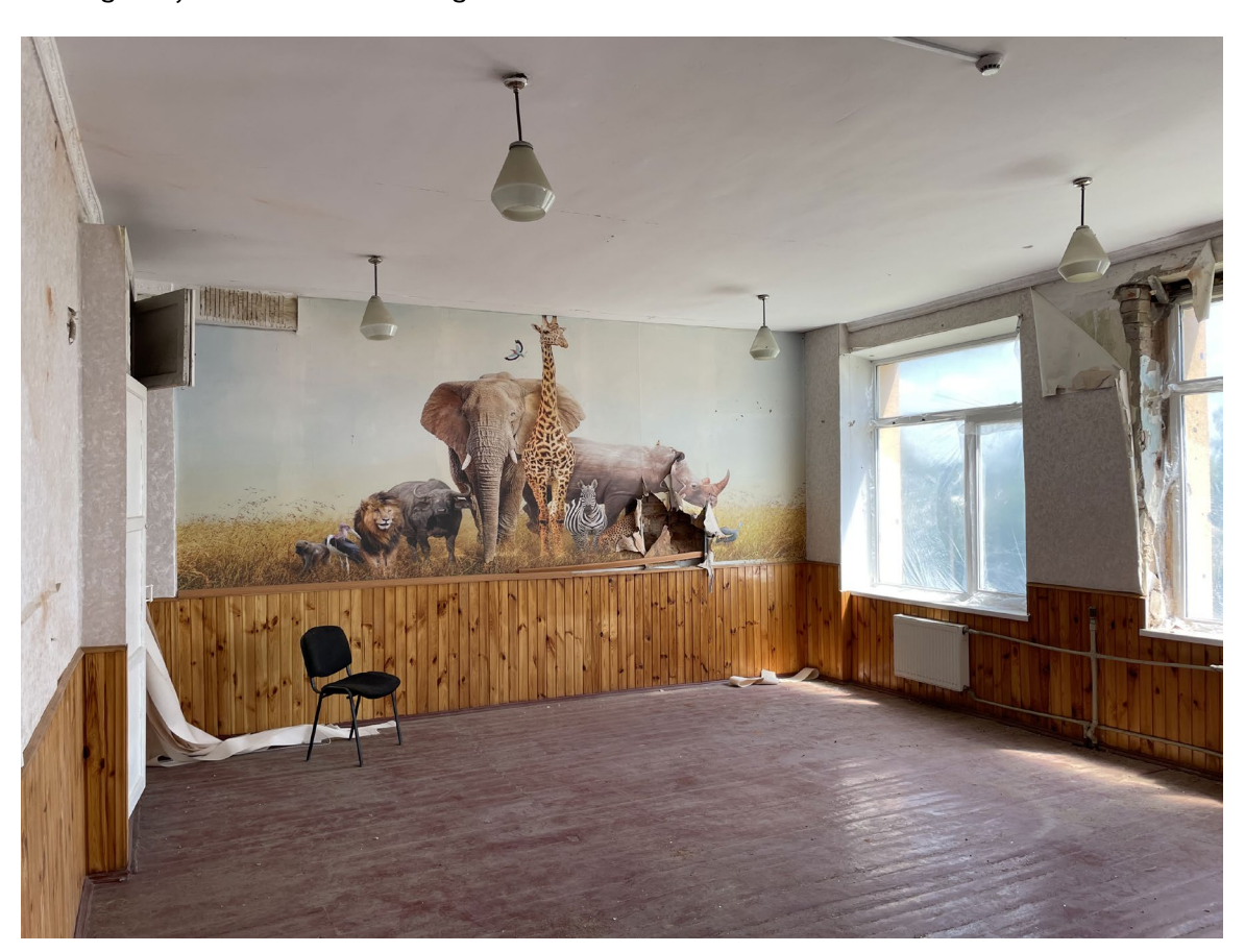
The town kindergarten in Novyi Bykiv, Chernihivska region, Ukraine, June 25, 2022. Russian forces encamped in the kindergarten for two weeks from late February to early March 2022.

Human Rights Watch researchers visiting the school found many windows blown out, broken internal doors, and holes on internal walls. Interior and exterior walls were visibly damaged by bullet holes and fragmentation.99