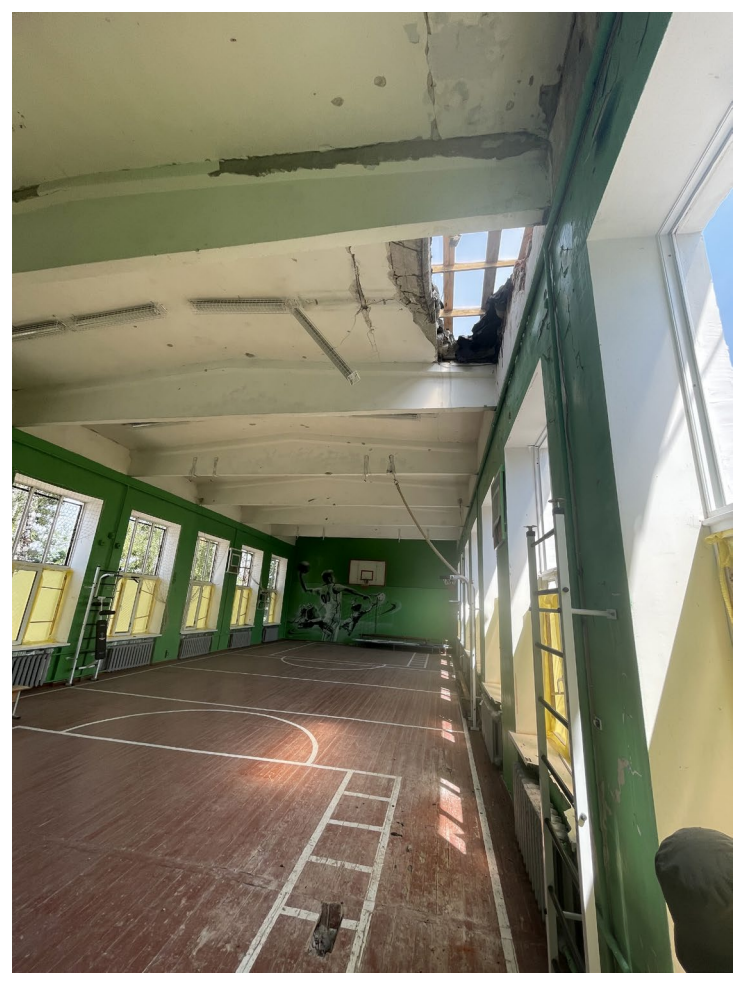
The damaged gymnasium of School No. 20 in Chernihiv, Ukraine, July 6, 2022. Russian attacks struck Chernihiv School No. 20 four times on March 6, 2022.

As of October 2022, reconstruction was underway to repair the roof and interior. The damaged windows were being replaced, the basement converted into a bomb shelter, and the classrooms renovated and furnished. The school's 923 students were switched to distance learning due to the renovations and the security situation, with continuing Russian military attacks on the city.80 Between October 2022 and March 2023, students were able to attend classes at School Number 3 until School Number 20 reopened to admit students in March. As of March 6, the second and third floor of the school were still closed for renovations, but