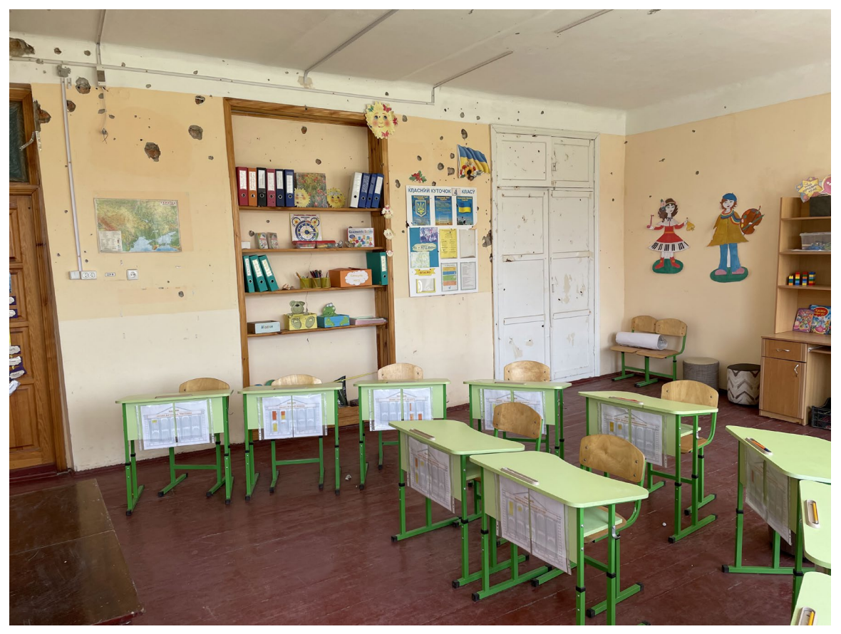
The town school in Novyi Bykiv, Chernihivska region, Ukraine, June 25, 2022. Russian forces encamped in the school for two weeks from late February to early March 2022.