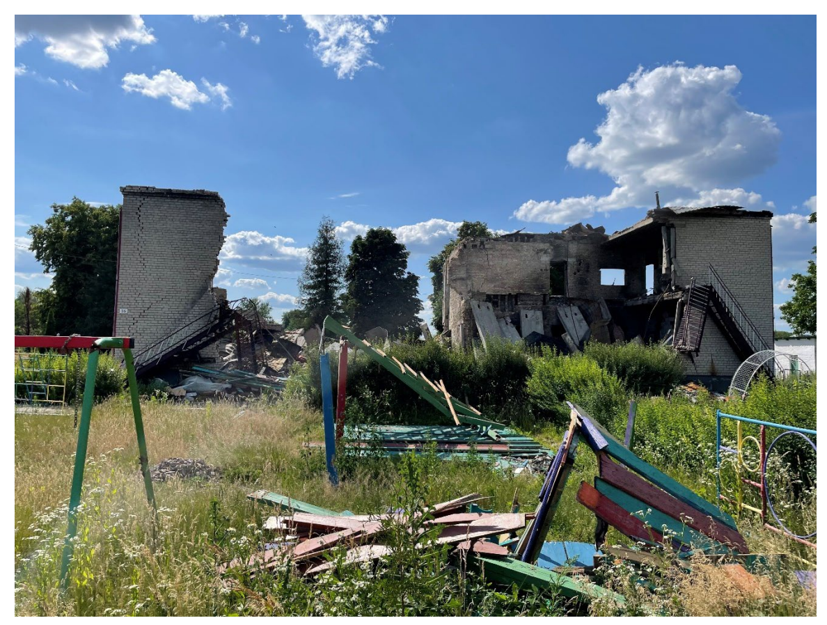
The damaged playground of the town kindergarten in Bohdanivka, Ukraine, June 25, 2022. In March 2022, Russian forces stored munitions and parked military vehicles at the kindergarten, which was later destroyed in unclear circumstances. © 2022 Human Rights Watch.

Vasyl said the day they took over the school, he saw Russian soldiers bring in 22 people in a Russian army Ural van as well as several military vehicles, including three tanks, one armored personnel carrier, and one MT-LB, an amphibious armored vehicle. A sniper deployed in the window of the school across from Vasyl's house. He said that wounded soldiers were brought to the school, leading him to believe they were using it as a medical facility. The Russian forces also stored munitions at a house around the corner from the school, where he saw Grad rockets, mortar shells, and a TOS-1 "Buratino," a multi-barrel thermobaric rocket launcher mounted on a tank chassis, as well as an Igla complex, a portable anti-aircraft missile system.