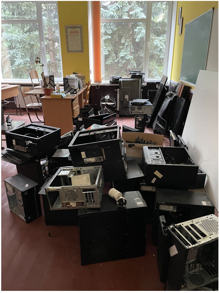
The remains of damaged and looted computers at School No. 3, Bucha, Kyivska region, Ukraine, following Russia's use of the school, June 23, 2022.

During the occupation, about 300 civilians, including children, were living in the school basement, using it as a shelter during the fighting. Russian soldiers removed them from the school and encamped there. Halyna Ivanivna said they "parked tanks on the playground" and other military vehicles in the schoolyard and also stored boxes of munitions in the school and schoolyard. When Human Rights Watch visited the school in June 2023, track marks were visible on paved surfaces on the school grounds.25