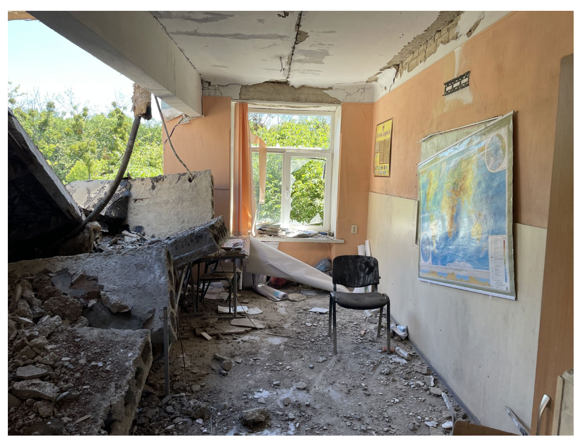
School No. 62, Kharkiv, Ukraine, June 27, 2022. The school was subjected to repeated Russian attacks in February, March, and April 2022.

Human Rights Watch researchers visited the school in June 2022. The secondary school entrance windows were blown out and its walls were damaged, and the severely damaged entryway was littered with broken glass and building debris. On the third floor, part of the roof had caved in on a classroom, landing on desks. Large holes perforated the walls on the ground and third floors. There were three large craters at the school's sport stadium. 125