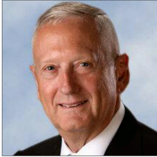
James N. Mattis Former U.S. Secretary of Defense

The Honorable James N. Mattis served as the 26th Secretary of Defense in 2017 and 2018. In this role, he worked to strengthen America's alliances and reorient the defense budget to face the rising challenges posed by emerging technologies and near-peer adversaries.