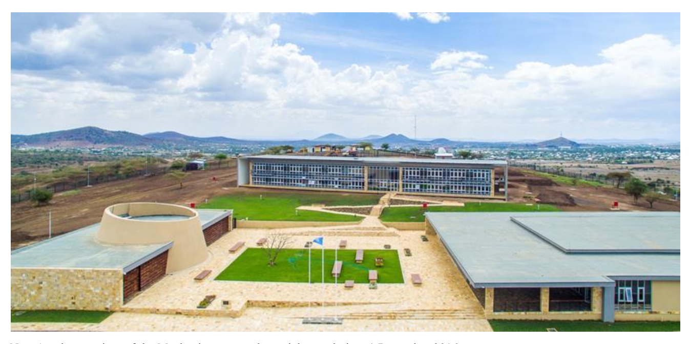
New Arusha premises of the Mechanism as at substantial completion, 1 December 2016