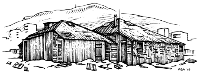
MAWSON'S HUTS REPLICA MUSEUM