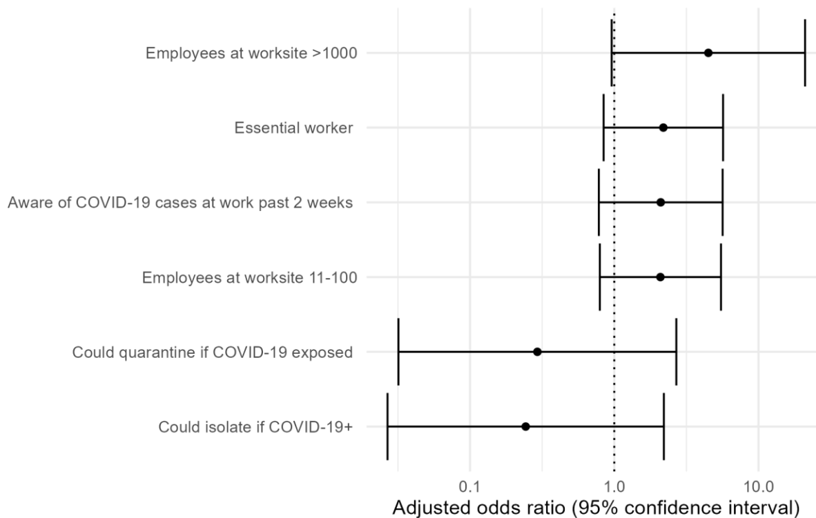
Figure 3. Adjusted odds (for industry sector and sampling date) of prior SARS-CoV-2 infection by workplace characteristics and infection prevention and control measures among adult ( \geq 18 ) employed participants ( N=167 ), North Carolina, 2021-2022

Note: only associations with a p-value <0.3 shown. Reference category is the same as in Table 3: for employees at worksite > 1000, employees at worksite 10 or fewer; otherwise, participants who did not report that characteristic (e.g., the reference for essential worker is not an essential worker).