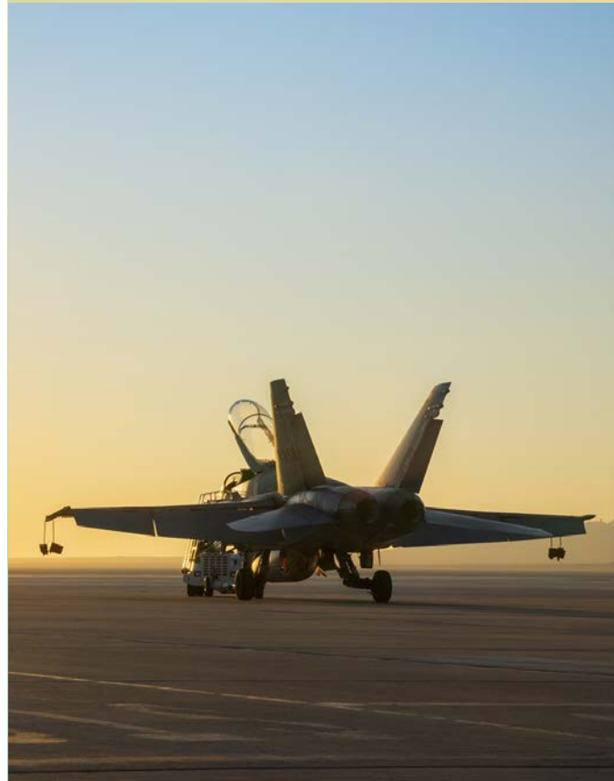
A NASA F/A-18 is towed to the apron at NASA’s Armstrong Flight Research Center in Edwards, California during sunrise over Rogers Dry Lake.

NASA is well aware that early engagement with vendors can add significant value and create efficiencies in the acquisition process. NASA is not only committed to the requirements of OMB’s 2011 memo but also to a transparent acquisition process and is poised to engage vendors in an increasingly innovative manner during the pre-award, award, and post-award contracting phase.