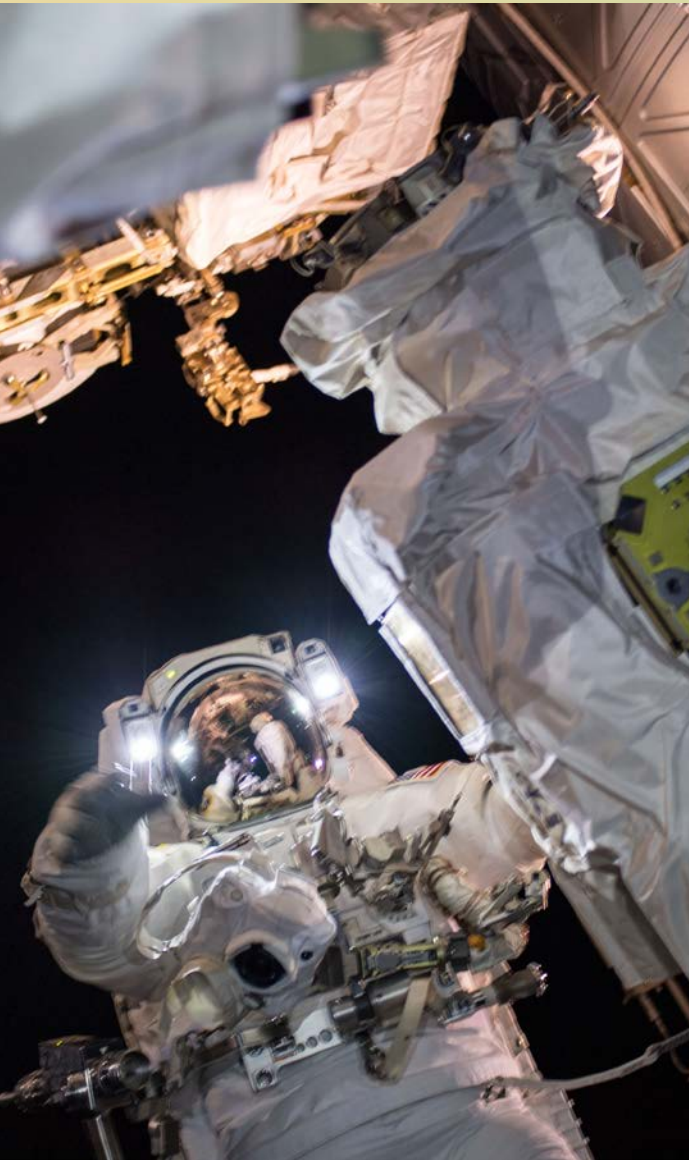
NASA astronaut Mark Vande Hei is pictured servicing components on the Canadarm2 robotic arm during a spacewalk