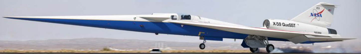
Illustration of the X-59 aircraft landing at Edwards Air Force Base.