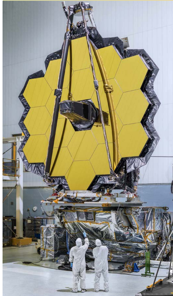
The primary mirror of NASA's James Webb Space Telescope, consisting of 18 hexagonal mirrors, looks like a giant puzzle piece standing in the massive clean room of NASA's Goddard Space Flight Center in Greenbelt, Maryland.

NASA HQ engagement events will include periodic outreach efforts such as virtual meetings, webinars, conference calls and face to face smaller round-table discussions or larger industry town hall meetings with vendors and industry associations on topics such as: the role of the Procurement Ombudsman; innovations in Supply Chain Management practices, novel and complex FAR and NASA FAR Supplement policy updates and how they affect industry, to