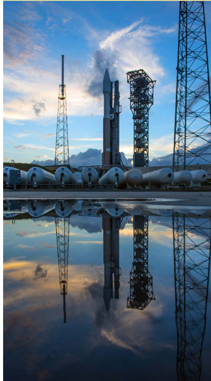
An Atlas V rocket with Cygnus spacecraft prepares to launch.

NASA vendor database is open to all vendors, both large and small, who wish to do business with the NASA. Vendors can post capability briefs in any format and sign up to receive email messages concerning business opportunities with NASA such as Source Sought Notices, the NASA Office of Small Business Programs Newsletter, Requests for Information (RFIs), and Requests for Proposals (RFPs). This database is web-based and available at https://www.osbp.nasa.gov/vendor_database.html .