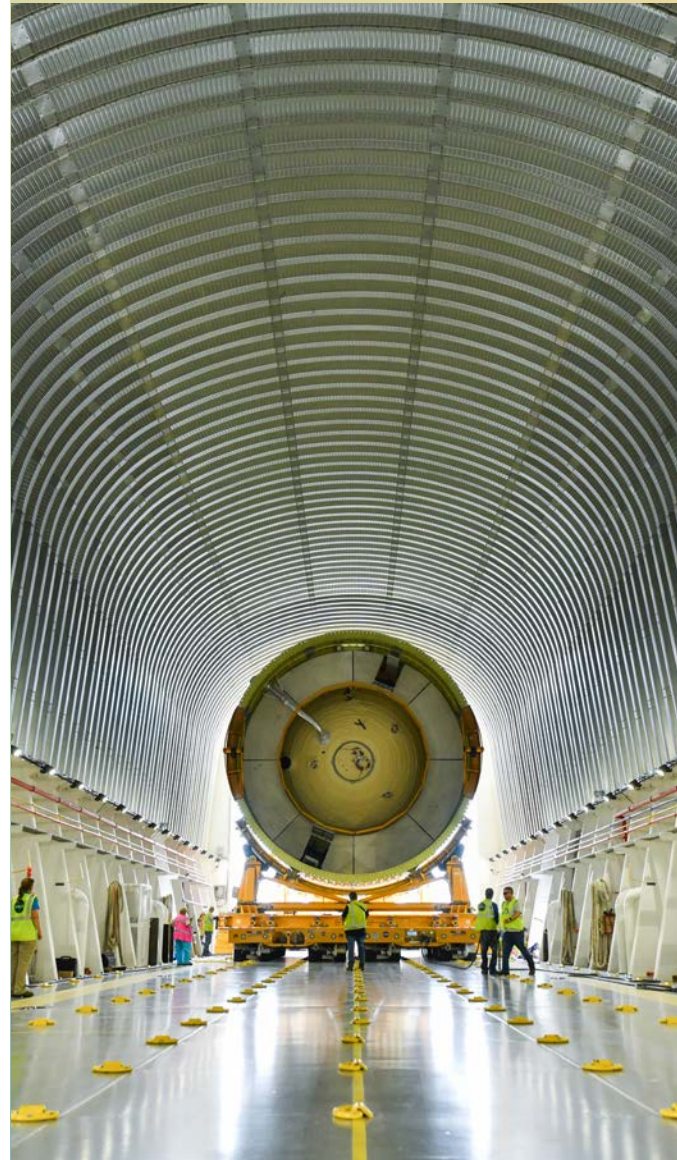
The liquid oxygen tank structural test article for the Space Launch System is loaded onto NASA's Pegasus barge

A pre-proposal conference to brief prospective offerors may be conducted after a solicitation has been issued, but before proposals are received, in accordance with FAR 15.201. NASA contracting officers, in coordination with management and the Source Evaluation Board (SEB), decide, prior to issuance of the RFP, whether a pre-proposal conference is required. These conferences benefit both the Government and prospective offerors in acquisitions where it is necessary to explain or clarify specifications and requirements. Prospective offerors have expressed appreciation for the opportunity to network with other industry representatives.