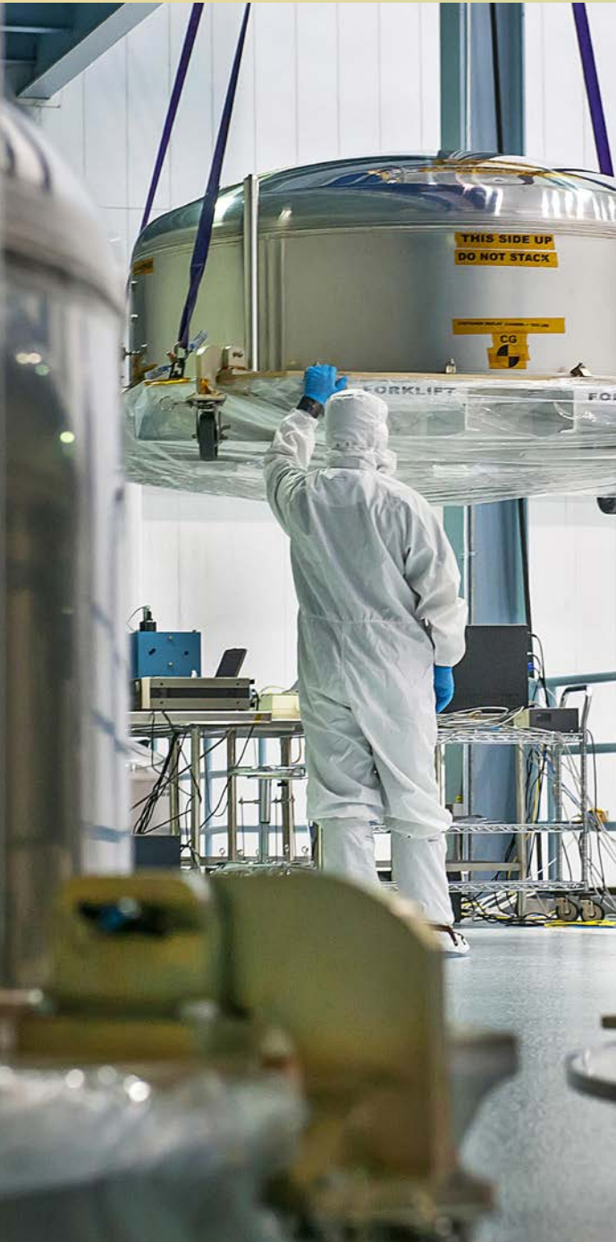
An engineer guides one of the canisters containing a mirror segment for NASA's James Webb Space Telescope.