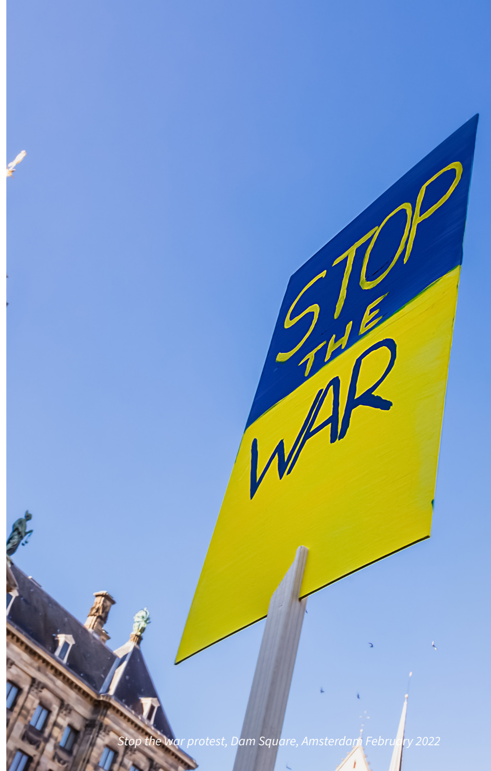
Stop the war protest, Dam Square, Amsterdam February 2022

Through our unique and historic networks and contacts, we are able to support change makers in these sectors by strengthening their capacities and by amplifying their voices. By building bridges between catalysts of change from different sectors and countries, we stand strong together for human rights, rule of law and justice in wider Europe.