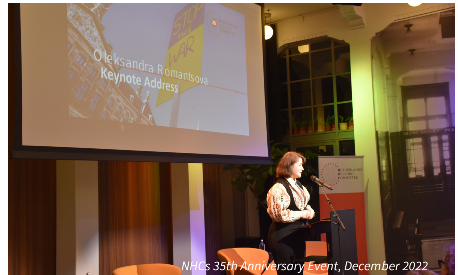
NHCs 35th Anniversary Event, December 2022