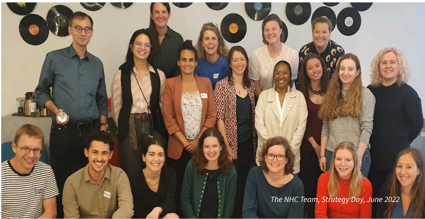
The NHC Team, Strategy Day, June 2022