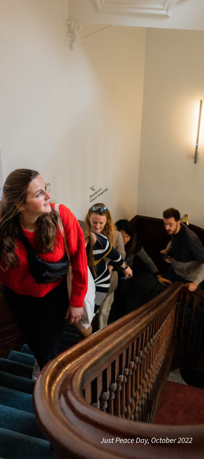
Just Peace Day, October 2022