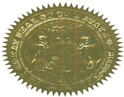
MICHAEL L. PARSON GOVERNOR

IN WITNESS WHEREOF, I have hereunto set my hand and caused to be affixed the Great Seal of the State of Missouri, in the City of Jefferson, on this 29th day of February, 2024.